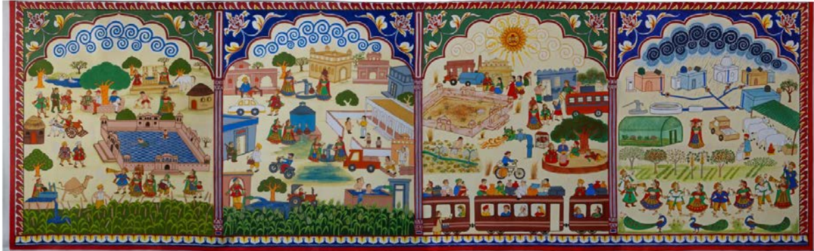
Figure 6. The scroll depicting Jhakhoda's water history and possible future.

and Kharif crops; the village appears to be in harmony with nature and the climate. Peacocks have also returned, which, according to Indian folklore, signals the coming of monsoon rains and the replenishment of water.