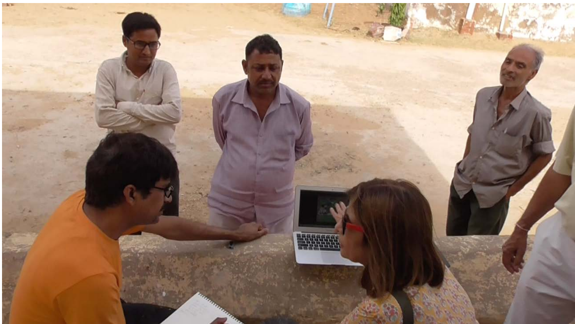
Figure 4. Members of the arts team discussing plans for the mural while Jhakhoda village residents look on.

In May 2018, the team worked intensively over three weeks with regional artists and local residents to tell the village's water story through painting. The artists combined Shekhawati and Phad painting styles into the production of a mural and canvas scroll, which is called a Phad . The mural was painted on the 10 foot by 22 foot wall of a highly visible school building in the centre of Jhakhoda; it narrated the history of the village's water use, including its decline and conservation efforts. The region of Shekhawati is well known for its frescos and murals which are painted on many of the region's havelis. These mansions, constructed mainly in the 19th century, were the courtyard homes of wealthy merchants and traders. Typically, the inhabitants commissioned painted murals to express their status and wealth; the result was Shekhawati's famous 'painted towns' (Cooper, 2009) where representations of gods, myths and faraway lands filled the streets in an open air art gallery. While many of these mansions are deteriorating, they remain popular tourist sites and are well known throughout Rajasthan and India. Although there are no havelis or murals in the rural village of Jhakhoda, these are familiar forms of architecture and graphic storytelling.