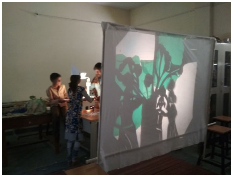
Figure 8. Young participants practicing for the shadow puppetry performance.

One of the stories which became a central component of the performance was called Worshipping the Well ; it was told to one of our water detectives by her grandmother. According to the story there are three sisters, one is kind and the other two are jealous of her; they hate how everyone likes her and they try to sabotage her life. When the kind sister marries, she faces many hardships in the home of her in-laws. She prays to the goddess, a local deity who is considered to be the goddess of the well or water source; the goddess is impressed with her kindness and reverses her fortunes while putting a curse on the other two sisters. Since then, the village's wells have been worshipped as symbols of the goddess that brings prosperity to families. There is also a ritual of worshipping the well when a child is born to ask for the baby's future health and prosperity; children involved in the project were fascinated by this story as it provided the context of a ritual they regularly practiced. Indeed, many people in Jhakhoda still 'worship the well' to this day, even if the ritual's original meaning and history is often forgotten.