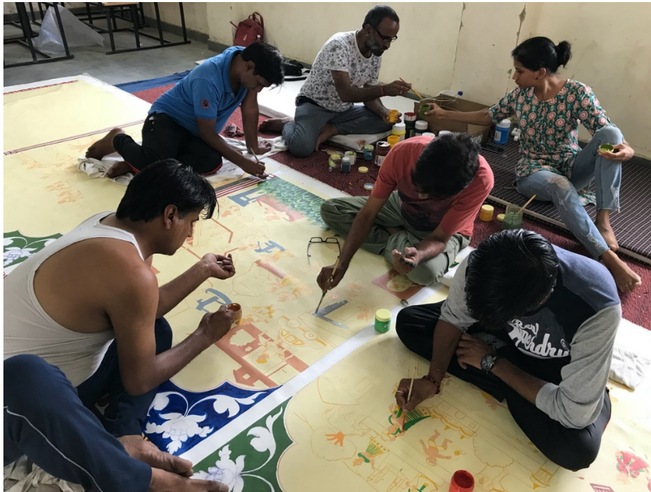
Figure 5. Phad painters working on the scroll.

As the quotes above indicate, the work in Jhakhoda provided a means for the artists to move outside of conventional painting traditions; it also allowed them to bring their art form into new contexts.