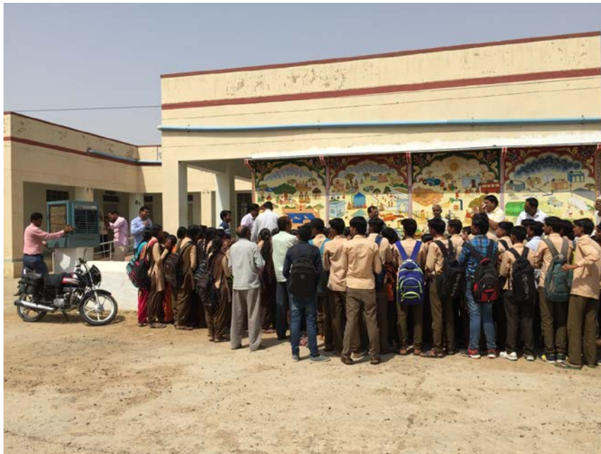
Figure 9. Students, residents, artists, and NGO representatives discussing the completed mural in the village of Jhakhoda.