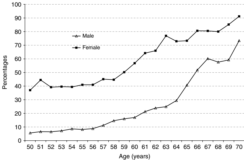
Figure 2. Percentage of employees in part-time work by gender, UK, 2009.