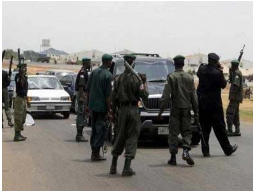
Figure 2 THE NIGERIAN POLICE AT A ROAD CHECK POINT IN LAGOS

The prime function of the Nigerian Police Force is to keep law and order, to manage traffic issues, and to maintain peace and security in Nigeria in collaboration with other law enforcement agencies (see figure 2).