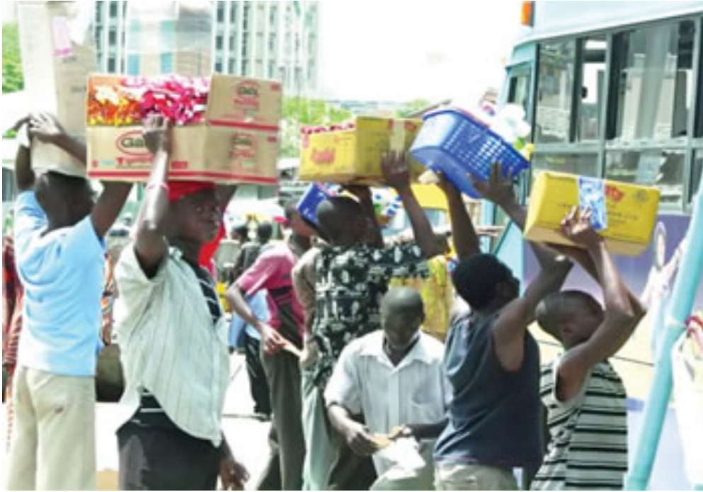
Figure 5. Street sellers/Hawkers selling alcohol and snacks to passengers and drivers at a highway petrol station