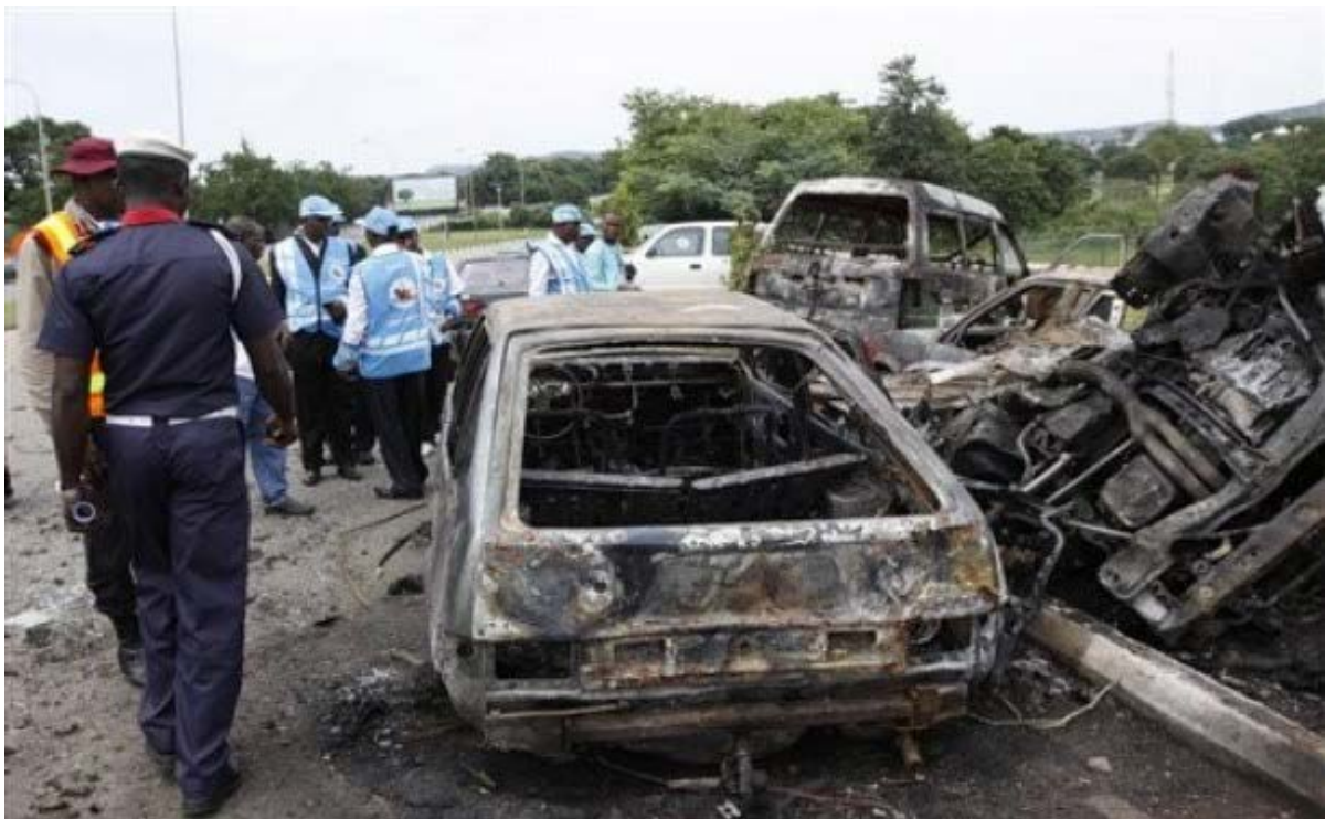
Figure 1 (VIO) INVESTIGATING ROAD TRAFFIC ACCIDENT IN LAGOS WHERE SEVERAL PEOPLE PERISHED

As the name implies, vehicle inspection officers are responsible for vehicle roadworthiness. VIO departments were established after the promulgation of the Road Traffic Act of the Federal Government of Nigeria, and are authorised to stop, detain, and impound any vehicle deemed not to be roadworthy. They are empowered to formally charge and take to court any driver driving a vehicle that is not fit to ply the federal roads of Nigeria (see figure 1).