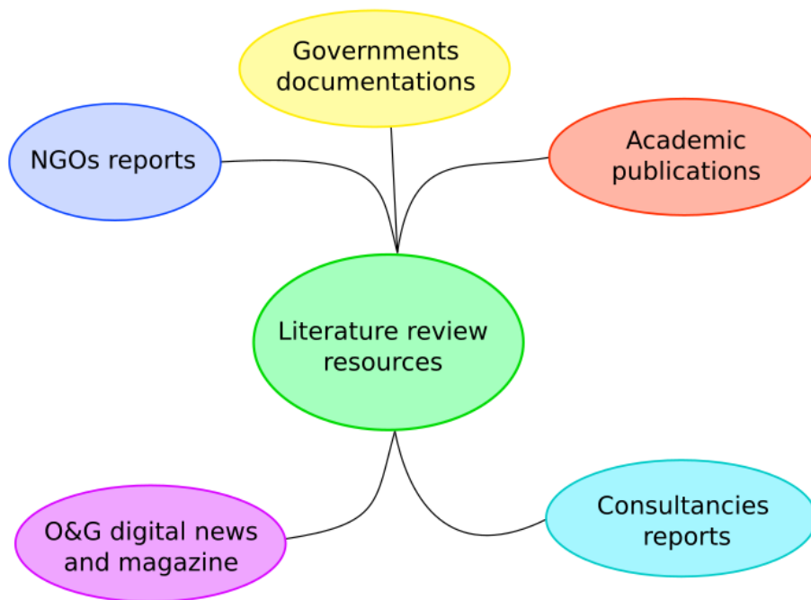
Figure 02. Map of sources for country comparison.

Comprehensive literature regarding the detail of specific licensing strategies is limited, although much of the relevant information is in the public domain. Therefore, extensive secondary research was conducted for this paper and data was drawn from a wide range of sources including government websites and documents, NGO publications, journals and magazines, news agency press releases and consultancy companies' report. A map of our data sources is shown in Figure 02.