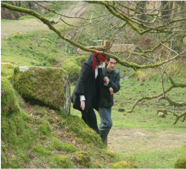
ROCKface participants engaged in Blindfold exercise