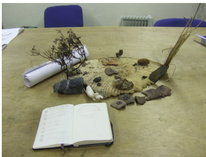
Interactive Map, created by workshop participant, Llewlyn Maire.

The map image is accompanied by a crowd of signs: titles, dates, legends, keys, scale statements, graphs, diagrams, tables, pictures, photographs, more map images, photographs, emblems, texts, references, footnotes, potentially any device of visual expression. The map gathers up this potpourri of signs and makes of it a coherent and purposeful... proposition . How these signs come together is the province of a presentational code, which takes as content the relationship among messages resident in the map and offers as expression a structured, ordered, articulated and affective display: a legitimate discourse. 258