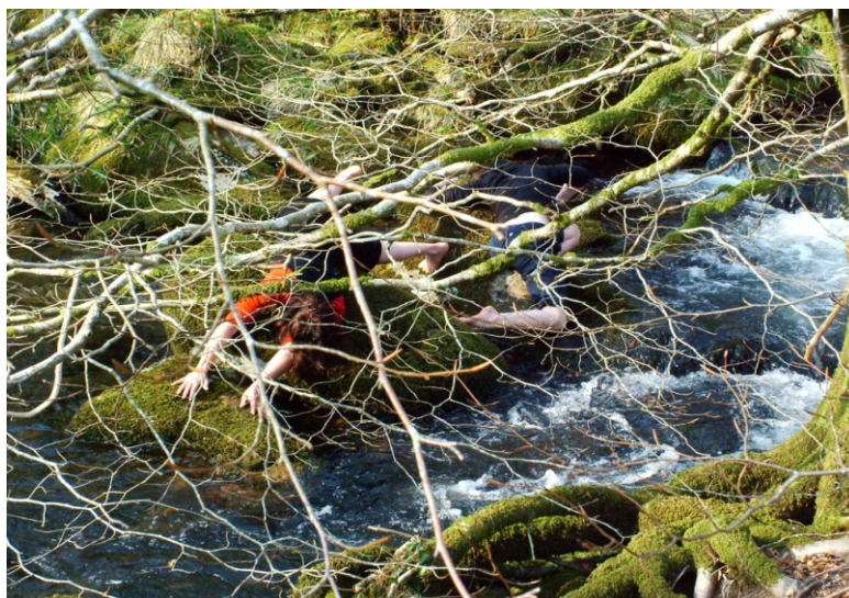
The Topographic Body