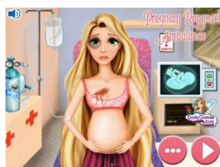
FIG. 1. Mafa.com ‘Pregnant Rapunzel Emergency’ screenshot, 2016

While the gender stereotyping in the actions and aesthetic is evident, this could be counterbalanced when considered alongside other imagery, scenarios and counter-narratives that she encounters in books and films. The gender roles offered in this game type, and on these hubs, mixing real-world simulation with role play, are undoubtedly limited (Pei Ling Ong, Tzou, : 2009), but can also be seen along side a much broader array of options that she encounters, through play, popular culture and people in her life. What is evident though, is that these are a poor substitute for sex education and that she’s ready for an alternative (preferably illustrated) explanation.