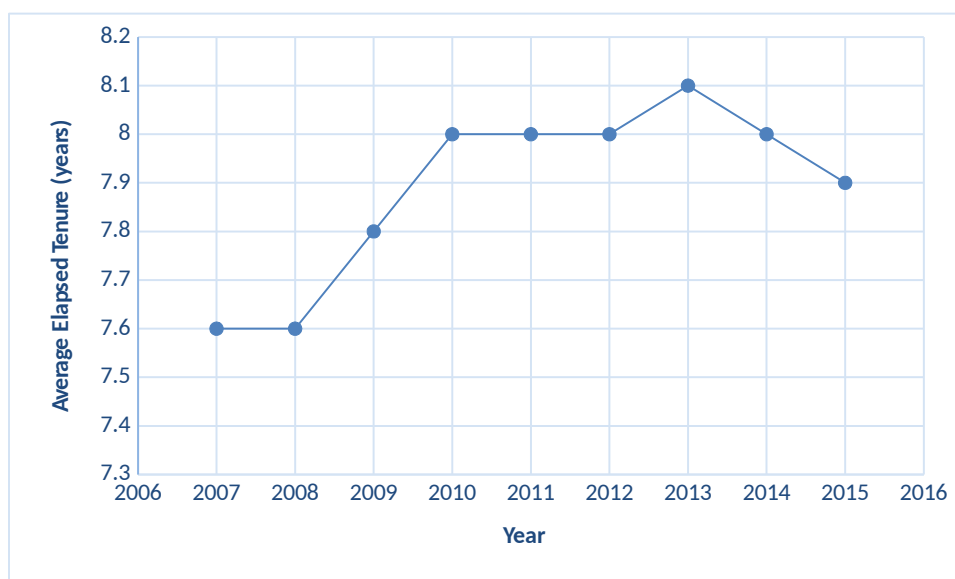
Figure 3.1 - Mean Tenure of Employment UK (2006-2015)

Source: Data from the Labour Force Survey