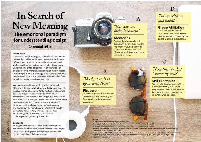
Figure 2 Poster from Des Cult group (CL)