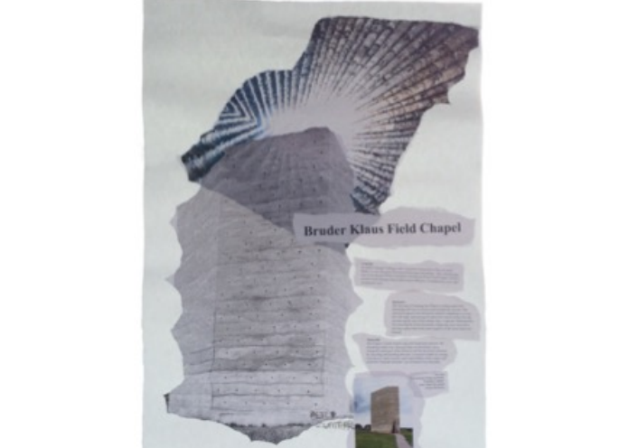
Figure 6 Poster from Interiors group (AK)

In terms of comments about producing the posters, a small number complained about the expense or difficulty of printing a poster at A2 size. This difficulty is addressed in a number