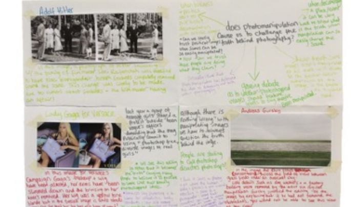
Figure 4 Poster from Photography group (KM)