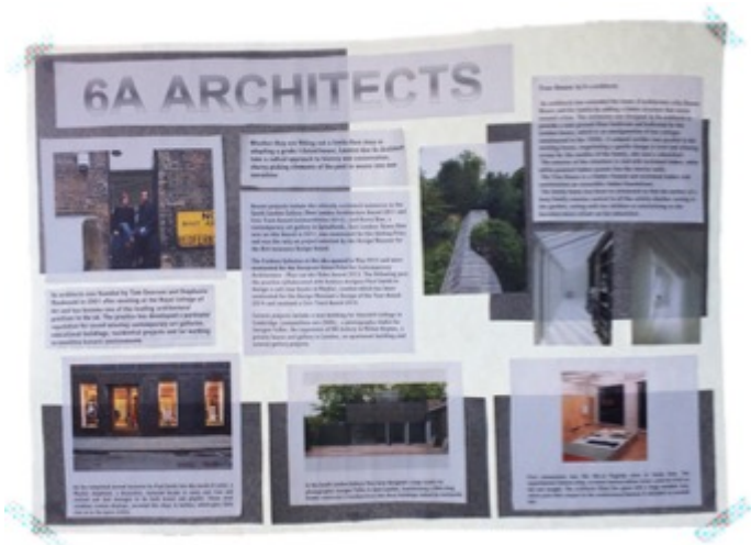
Figure 5 Poster from Interiors group (MC)