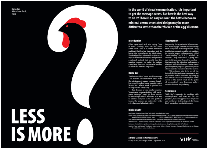
Figure 1 Poster from Des Cult group (AM)