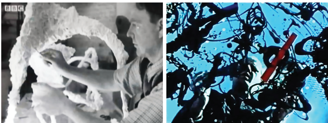
Figure 3. Rendering the invisible visible: A juxtaposition of indicative screen grabs from Jackson Pollock 51 and Henry Moore, where each artist’s body fuses into the materiality of the creative process. Both artists perform for the camera and engage in newly adopted techniques: Pollock painting on glass, making his ‘dripping’ technique visible; Moore working on the plaster model for what will become the bronze sculpture Reclining Figure Festival (1951), a work considered as emblematic for his shift from direct carving to modelling. For more information on how to access the films online, see endnote 35.

Moore’s and Pollock’s new methods, techniques, and choice of materials had attracted art-critical attention for their radical break with tradition. In the early 1940s, both artists had set up their studios away from the city, erecting the walls of their modernist laboratories in isolation. In