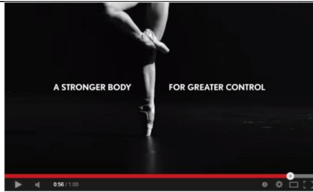
j Lexus IS 2013 TV advert: Poise

In this one-minute video, dubbed ‘Poise,’ Tamara Rojo, an accomplished ballerina, presents a dazzling performance that implicitly compares her skilled movements with the performances of the Lexus IS 2013 car. Images of the car frequently appear together with or soon after every dance move. The dance ends with the following words: “A strong body for greater control.” These attempt to connect the dance with the Lexus IS car.