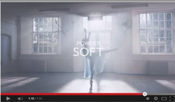
NIVEA Powder Touch Deodorant

In this one-minute video, dubbed ‘Poise,’ Tamara Rojo, an accomplished ballerina, presents a dazzling performance that implicitly compares her skilled movements with the performances of the Lexus IS 2013 car. Images of the car frequently appear together with or soon after every dance move. The dance ends with the following words: “A strong body for greater control.” These attempt to connect the dance with the Lexus IS car.