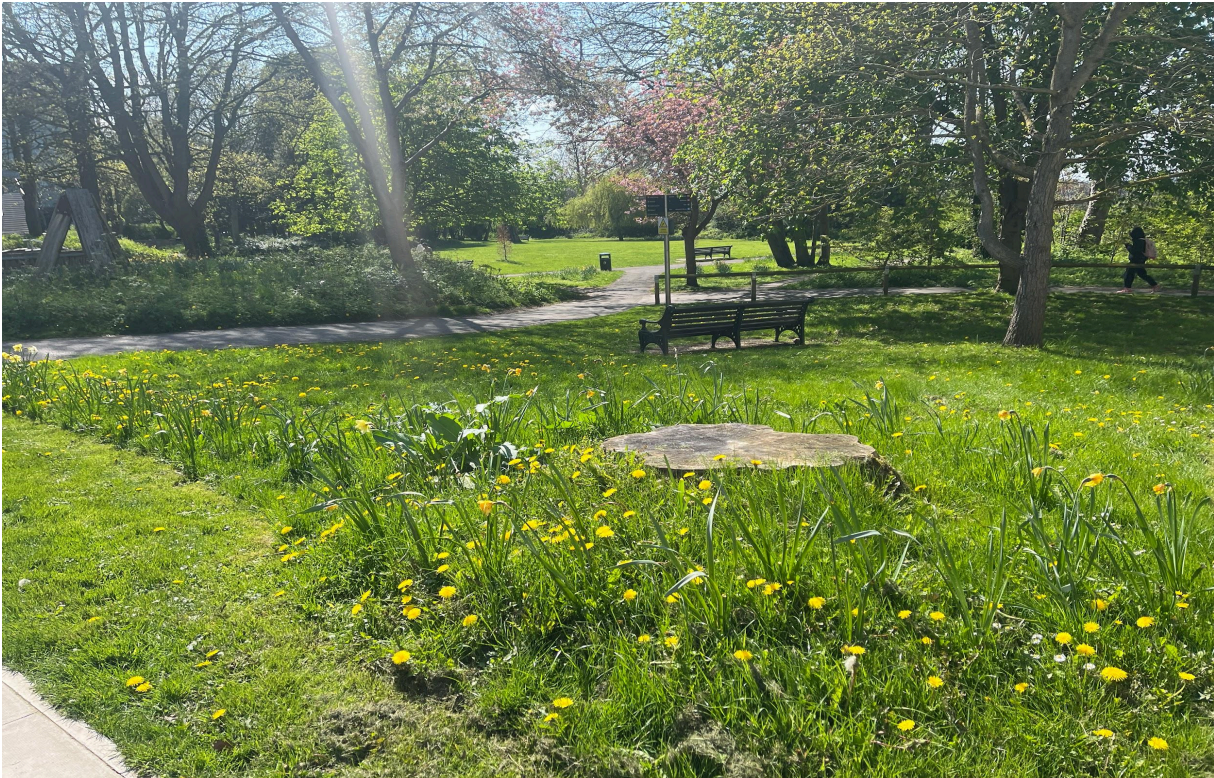
Figure 5. Campus springs to life

The Pavilion is a notable landmark on Middlesex University campus, which is a relatively green space, especially given its city location in London. Participants were invited to convene on a large expanse of grassland adjacent to the Pavilion, which was carpeted with spring daffodils, edged by budding oak trees, and awash with audible birdsong. Student bodies were making their way across campus, and occasionally settling down to socialise on benches, and at tables (see fig. 5).