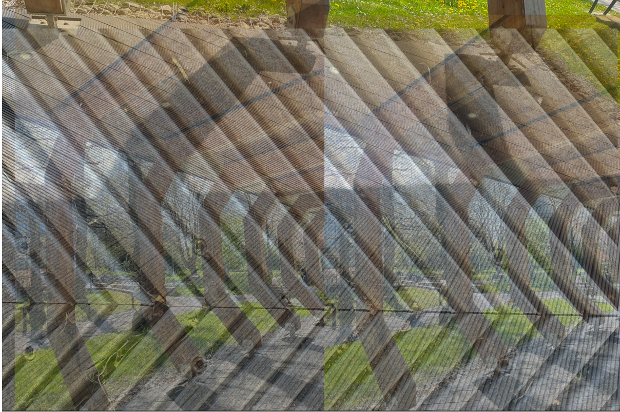
Figure 3. Pavillion agitations