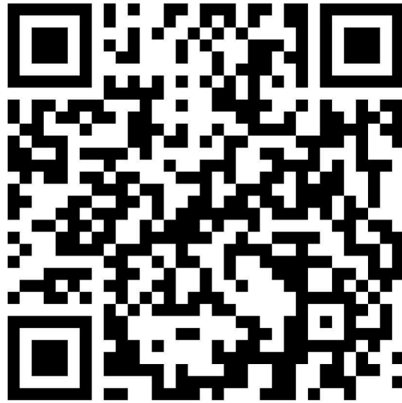
Fig 8. QR Code, Childing-with-daffodils