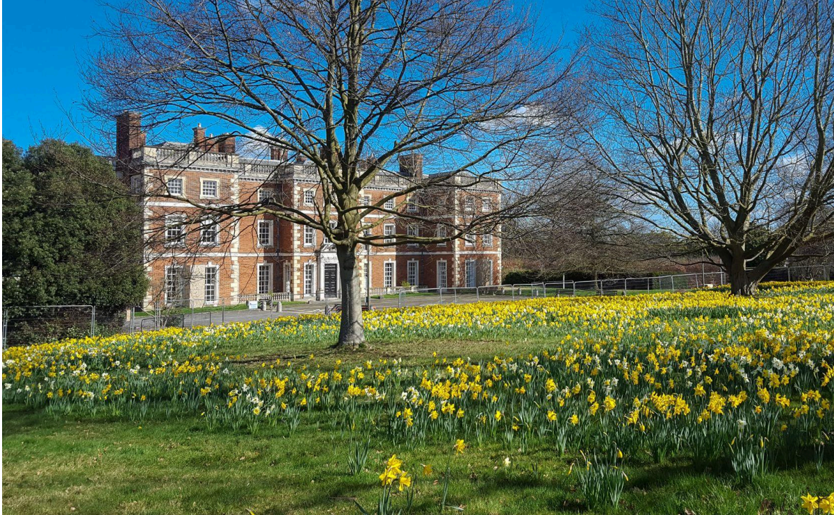
Figure 6. Daffodils, Trent Park

The campus has not always been in its current location; for many years Middlesex University was located in Trent Park (see fig. 6). Following the second world war, in 1947 the university occupied a Grade II listed manor house, located in 413 rolling acres of meadows, enchanting brooks, lakes and ancient woodland. Originally part of the Duchy of Lancaster, Trent Park is the former estate of a nobility who deemed it to be the perfect venue for political and social entertaining, as evidenced through regular visits from King Edward VIII, Charlie Chaplin, Sir Winston Churchill, and latterly Queen Elizabeth. The college carved out a reputation for provisioning specialist qualifications for teaching Art, Drama and Music, earning itself the epithet, ‘Bohemian College’ (Trent Park House, 2024). However, the vast manor house proved too expensive to maintain and by 2013 was largely derelict seeing Middlesex University relocate to an altogether more modest and pedestrian site. The relocation to a less esteemed locale remains a source of great consternation and sadness for staff who remember the ‘ good old days at Trent Park ’. Architectural grandeur and the antiquity associated with this learned place of stature; not to mention the sheer scale of the manor house came with certain gravitas that is not rivalled by the university’s current location in the heart of a London suburb.