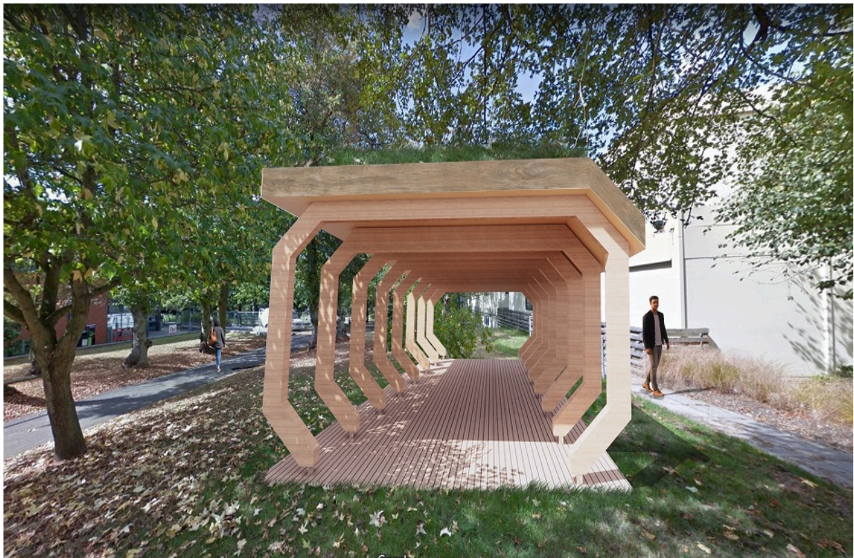
Figure 2: Architect Image of The Pavilion at planning stage

As already outlined, we refused to issue instructions, directions or state expectations for the workshop. Rather, participants were invited to explore the green expanses of the campus with a set of provocations in mind (see fig. 1). As facilitators we considered our role to be little more than providing conditions of possibility for childing to unfold. After a quarter of an hour or so we walked across campus to join the participants. We noticed the force of a large wooden framed structure had lured them from the grassy, daffodil infused meadows.