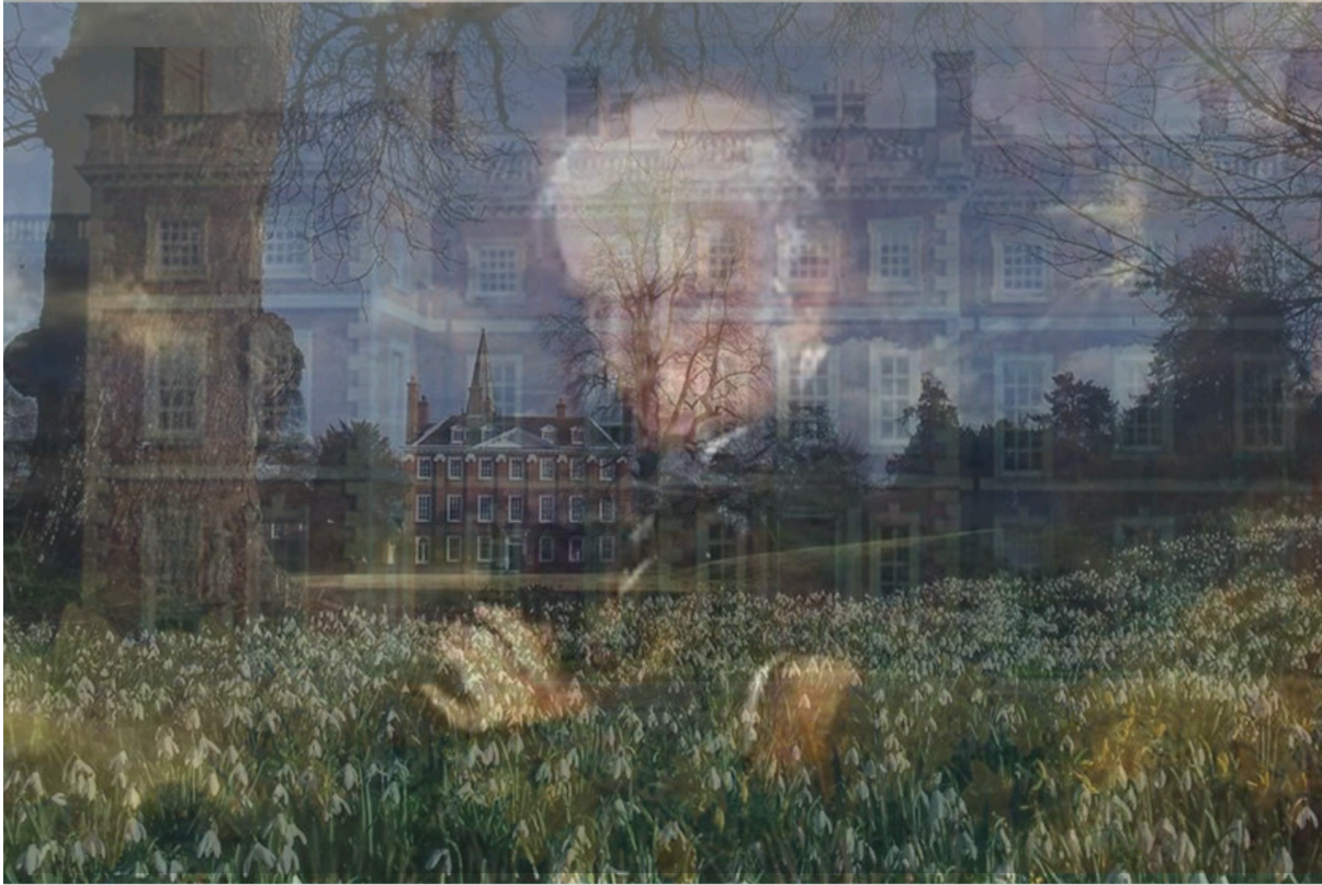
Figure 7. patriarchal-colonial-daffodil-hauntings

When daffodils are viewed as natureculture configurations, their status as natural, romantic and poetic becomes dislodged, instead they can be re-membered through their patriarchal, colonial and imperial inheritances. It is worth noting that plants and botanical sciences more broadly were at the forefront of the cultivation of colonialism and sustenance of the empire. Colonisation has been described as a ‘massive operation of planting and ‘displanting’’ (Mastnek et al., 2014, p.364). As in Kincaid’s (1990) Lucy , daffodils were introduced during Sid’s childhood in postcolonial India as part of colonial education through Wordsworth’s romantic poem I Wandered Lonely as a Cloud . Rote memorisation, recitation and interpretation of the poem jarred with childhoods that had never witnessed daffodils. Sid first encountered them as a teenager on a family trip to the hill station Ooty. With its cool climate, Ooty was a desirable location for European colonists seeking respite from the stifling heat of the Indian plains. The landscape was subjected to numerous colonial transformations, especially the introduction of European trees and plants, including daffodils, to give a sense of ‘Englishness’ to ‘nature’. As Philip (2017) argues, planting daffodils exposes the messy power relations of natureculture imperialism and its