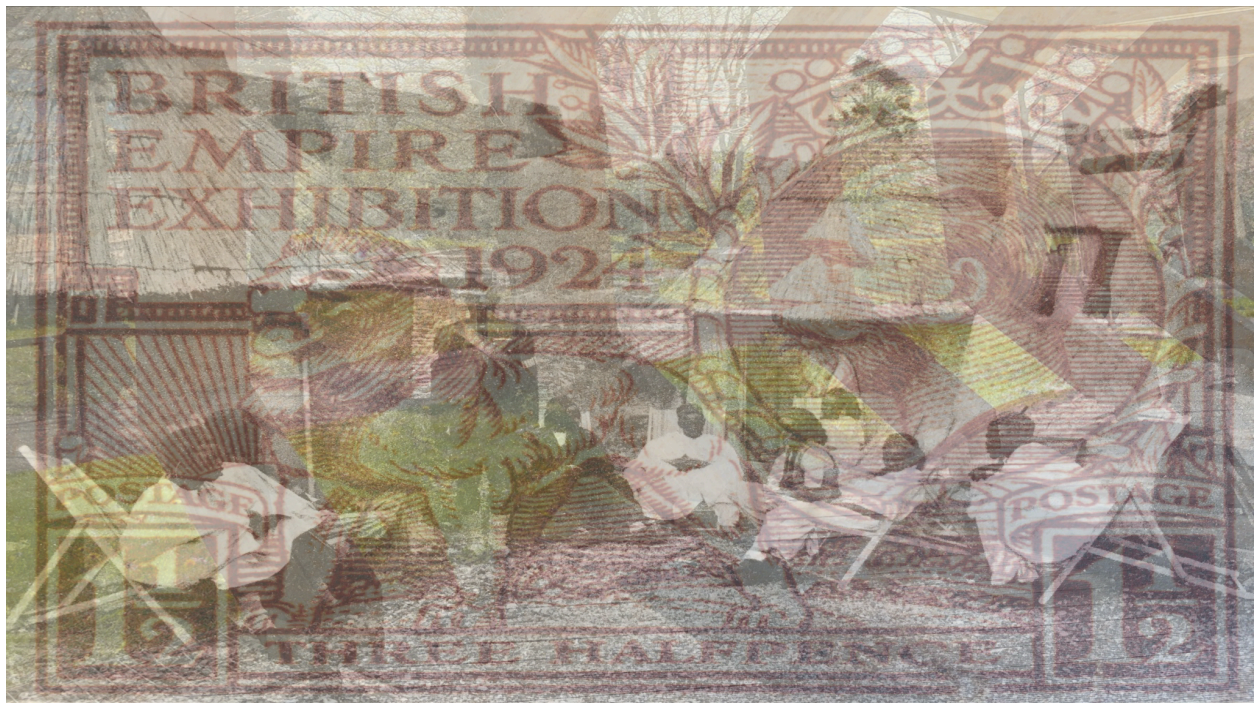
Figure 4. Pavilion hauntings

Childing in and from the Pavilion emerges as a practice of refusal that is intertwined with, and not separate from, the colonial and neoliberal rationalities that make up the University. However, we agree with Moten and Harney (2004, p.101) in our refusal to accept the University as a place of enlightenment, instead we acknowledge it as a place of refuge for what they call the ‘Undercommons’, where the work gets done and subverted. Childing in and from the Pavilion does not resolve in being for or against - rather it involves ‘being in it and remaking it, rather than indulging in the misery of academia’ (Bozalek, 2024, p.168).