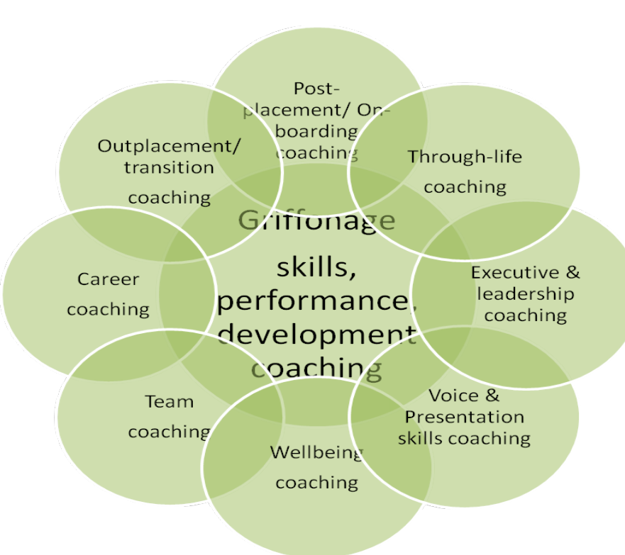
Figure 4 – Griffonage tree