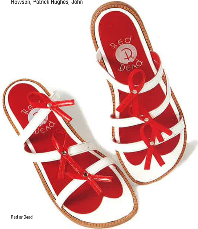
Red or Dead

There is also a special section devoted to works by celebrities from all areas of the performing arts, the media, sport and public life. The Show offers visitors the chance to discover the hidden talents of stars and celebrities, including Darcey Bussell, Chris Evans, Sean Hughes, Mark Lamarr, Joanna Lumley, Richard O'Brian, Red or Dead, Nick Ross and Toyah Wilcox.