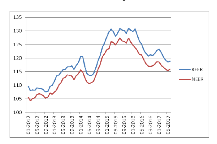
Figure 3 Nominal and Real Effective Exchange Rates (NEER and REER) for RMB

Notes: 1. data sources: IMF exchange rate data, Exchange Rate Query Tool www.imf.org/external/np/fin/ert/GUI/Pages/CountryDataBase.aspx. 2. The exchange rates are expressed as RMB per unit of foreign currency, calculated by using exchange rates between each currency against SDR. An increase indicates a depreciation.