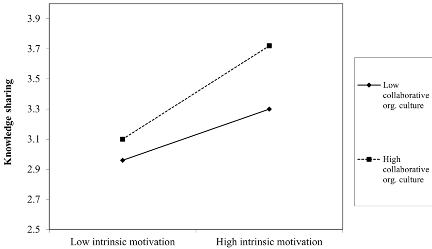
Fig. 2 Collaborative organizational culture moderating the relationship between intrinsic motivation and knowledge sharing