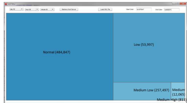
Figure 2: The Concern Level Assessment (CLA) TreeMap

medium-low, but we determine that the facility as a whole is a cause for concern. The majority of the low and medium-low concern levels were due to machines with a policy status other than 1. These concerns are also flagged for a high number of connections, login failures, and high CPU consumption on specific machines types.