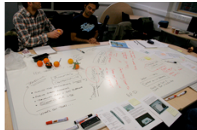
figure 2: Writeable table surface