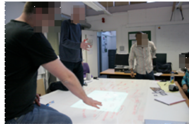
figure 1: Engagement around the table

From a situation where single presenter performed for a largely passive audience, we moved to one where group members engaged more directly with the presented materials ( figure 1 ). Standing up provided a