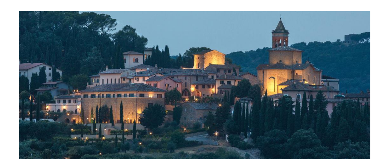
Figure 4 Solomeo

Brunello Cucinelli's environmental functioning relates to the conservation and restoration of the natural landscape and the historical heritage of Solomeo and the Umbrian countryside where the company is located. The Umbrian landscape has always been considered by Cucinelli as one of the main resources of his company. He decided to establish his company in the Solomeo Castle. Since 1985, the company has been involved in a continuous refurbishment of the castle and the restoration of the village of Solomeo. The work avoids any hard modernization in order not to violate the harmony of the Umbrian landscape. (Figure 4)