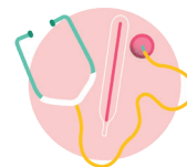
Unexpected health issues