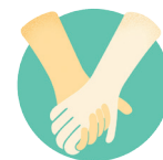
Carer to a family member