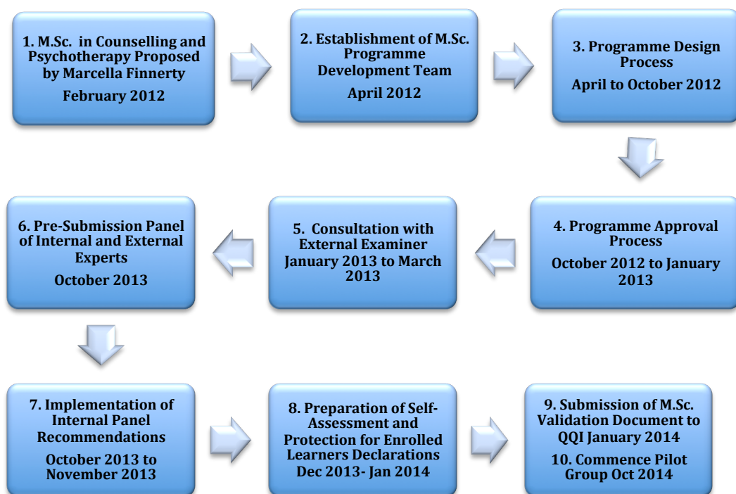
Figure 2: Flow chart of the Validation Process for the IICP Master's in Science in Counselling and Psychotherapy

The flow chart hereunder outlines the stages in the process of bringing the master's degree programme from concept through to planning, design, consultation and preparation for final validation. It also includes a synopsis of the proposal for the validation document which has been submitted for approval to QQI. The master's programme is a two-year part time course with taught modules, a professional practice module and a dissertation to focus on both qualitative and quantitative research within the field.