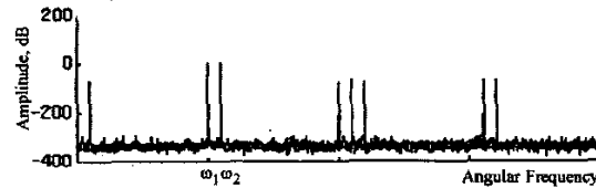
Figure 3: The spectra of the output signal.

Equations have also been derived for n-input systems and simulations have been performed. Initial findings show that the proposed system works for any number of input signals and two amplifiers only. There would be one phase shift circuit for each carrier signal. On completion of the simulations, the results will be presented in another publication.