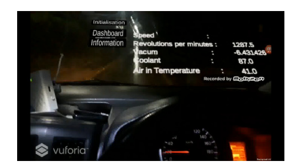
Fig. 7. AR Dashboard

6) AR and Vehicle Dashboard: While AR is still in the development phase, industries are evaluating its potential and impact. When it comes to complicated operations in the sphere of industrial applications, such as construction or maintenance in the automobile industry, augmented reality (AR) solutions are positioned to have enormous potential for businesses. Major corporations like BMW, Mercedes, Volkswagen, and Volvo have already started to implement AR. A specific targeted object is displayed in 3-D context-specific data in a real world via human-centered technology. The quality of training, task efficiency, and maintenance goals are all predicted to improve with immersive experiences. Our prototype uses AR to display sensors data from a car into AR on its dashboard Fig. 7 shows sensors data being projected in AR.