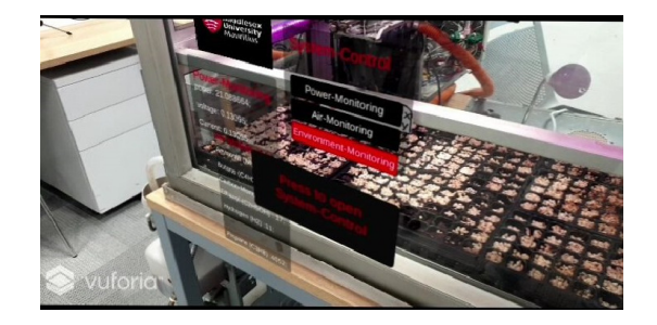
Fig. 6. AR Smart Nursery

The prototype shows how a system can be used to monitor and control the environment, energy utilization, and plant growth inside a growing chamber using robotic devices. An active air monitoring system has been added in addition to the variables that can be regulated, such as carbon dioxide, air temperature, humidity, pH, and root-zone temperature. The user was able to view real-time data within the growth chamber thanks to the projection of all the collected data into augmented reality. Fig. 6 showcases the work developed.