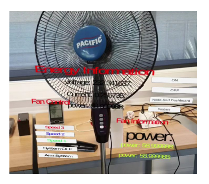
Fig. 3. Electrical appliance control

2) AR and control of electrical appliances : The prototype was further extended for individual appliance control whereby the energy consumption of a fan as shown in Fig. 3 could be obtained on the augmented reality software. The speed of the fan could be changed accordingly and the change of energy use was updated on the android software in augmented reality. The augmented reality android application provided the user with the ability to select three different speeds of the fan together with its real time energy consumption at the selected speed. In this case the fan was directly interfaced with a Raspberry Pi.