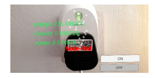
Fig. 2. Energy monitoring

The mobile phone's camera image frames were compared to the image recognition database. After performing picture identification, the mobile phone's software asks the Node-Red server for the live data.