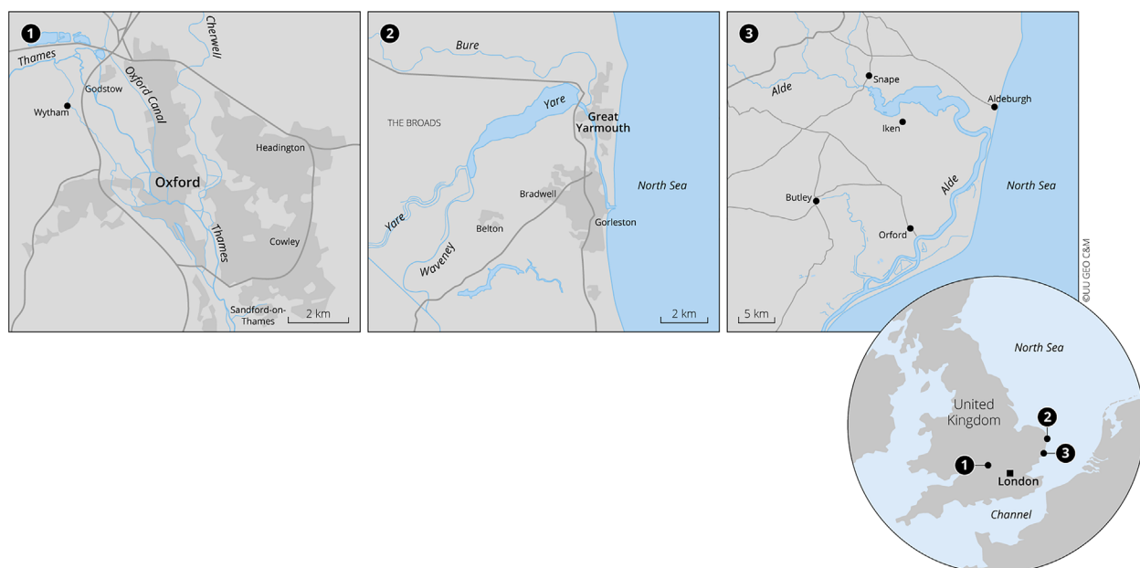
FIGURE 1 Overview of the study locations in relation to the types of flood risk

We aimed at a sample of residents across a range of ages, who are at risk of a range of types of flood risk, and who either have experienced flood event(s) or have experienced the threat of floods. We conducted 21 extensive interviews of 60–90 minutes with residents of flood risk areas in Oxford, Great Yarmouth, Aldeburgh and their surroundings; of these 21 interviews, 12 respondents had not been flooded and 9 had experienced one or more