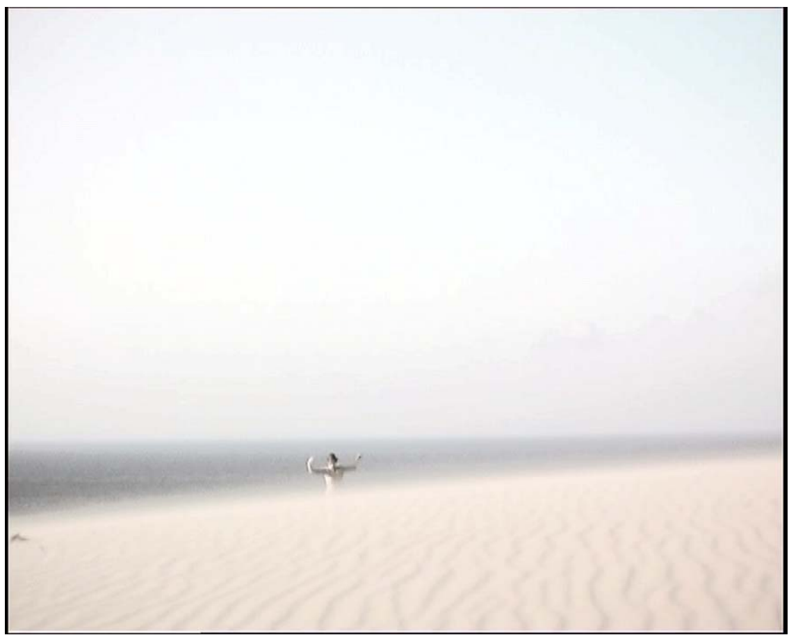
Vanishing Point by Rosemary Butcher

critical response, even though it is also the case that in each new instance, it is required to be 'new'. Thus signature practice is not simply singular, but – apparently paradoxically – it is recognisably so, and coherent with the discipline, hinting at the presence of performance 'regularities', across the body of her work. It is apparently challenging, but at the same time its production values are professional, hence more or less stable in terms of, or referencing the terms specific to external evaluation; and its 'newness', when it emerges, excites rarely consistent expert commentary.