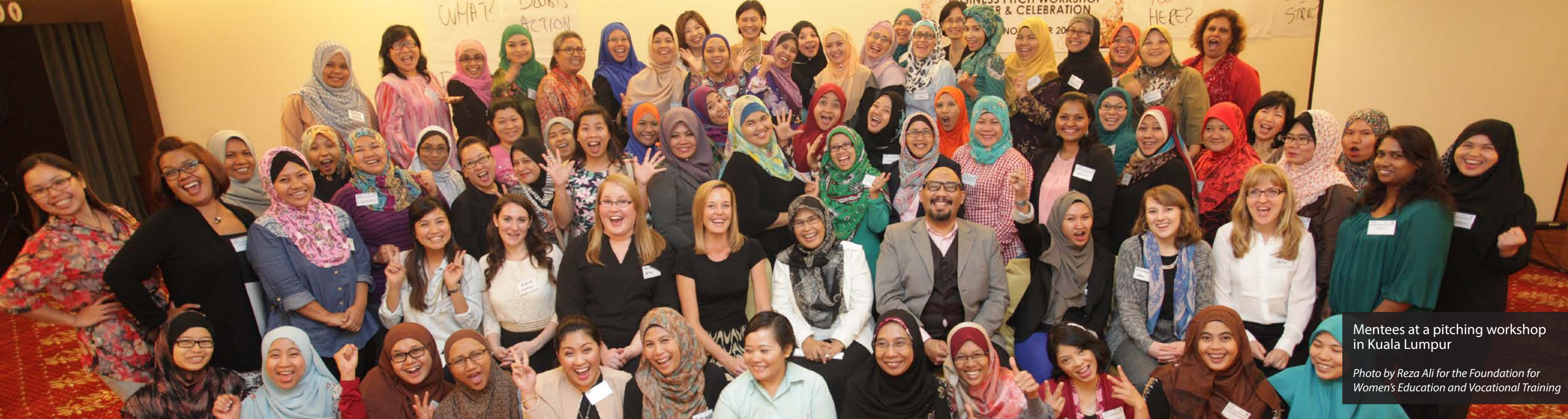
Mentees at a pitching workshop in Kuala Lumpur