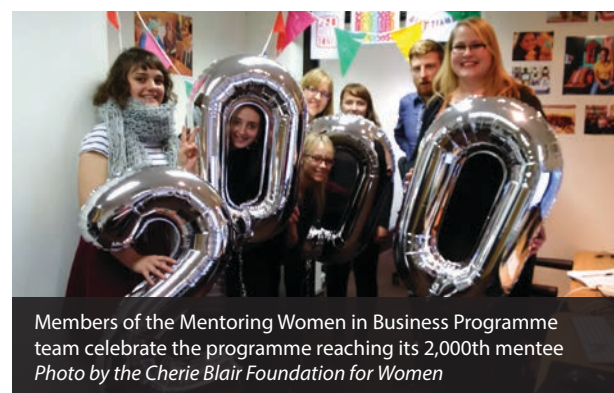
Members of the Mentoring Women in Business Programme team celebrate the programme reaching its 2,000th mentee

When compared with the Cherie Blair Foundation for Women's programme, very few other programmes have a comparable scope in terms of the number of participants and geographical spread. Equally, the staff who run, manage and deliver other programmes are usually fewer in number and under resourced. Mentoring supervision is an important aspect of any programme, but organisations are often unable to dedicate the resources needed to support this function. However, the Cherie Blair Foundation for Women's programme dedicates a whole team to managing the mentoring relationships of their participants and position this as a key part of their model.