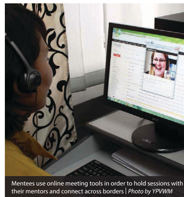
Mentees use online meeting tools in order to hold sessions with their mentors and connect across borders

If mentees don't fill in their forms, the team follows up to ensure that the mentoring process is on track and offer extra support. In addition, they check in with mentors by email three times during their mentoring relationships. They also have a 'help desk' staffed by relationship support officers who respond to queries from mentees and mentors on an ongoing basis. At the end of the 12-month relationships, the team asks mentees and mentors to complete a final feedback form, which links back to baseline data taken at the application stage.