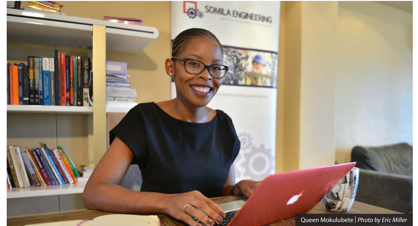
Queen Mokulubete