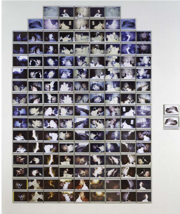
Figure 5: Carolee Schneemann, Infinity Kisses (Xerox ink on linen, 84 x 72 in. (213.36 x 182.88 cm), 1981–1987). San Francisco Museum of Modern Art, Accessions Committee Fund purchase: gift of Collectors' Forum, Christine and Pierre Lamond, Modern Art Council, and Norah and Norman Stone © Carolee Schneemann / Artists Rights Society (ARS), New York/DACs Society, London.

In the video Vesper's Stampede To My Holy Mouth (1992), filmed and edited by Victoria Vesna and Carolee Schneemann, the artists set out to explore “suppressed feminist issues of female subjugation, the unconscious, the paranormal and goddess religions.” The result