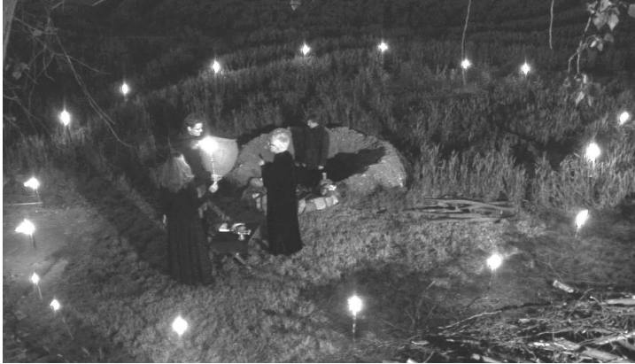
Figure 2: Mathilde ter Heijne, Experimental Archeology: Moon Rituals HD , single screen video (2007) Production shot, November 2006.