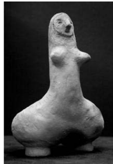
Figure 3: Mathilde ter Heijne, Female with Phallus Head Starcevo (Endröd-Szujóskereszt, Körös Valley, SE Hungary; c. 5600–5300 BCE). Fusion of Goddess power (buttocks, v-shaped incisions) and cosmic pillar (phallus form). Reconstruction of the original, wood-fired ceramic, 18.5 x 13 x 8 cm.

Archaeologist Marija Gimbutas' works The Goddesses and Gods of Old Europe: Myths and Cults (1982) and The Language of the Goddess: Unearthing the Hidden Symbols of Western Civilization (New York, 1989), have been extremely influential in regard to feminist