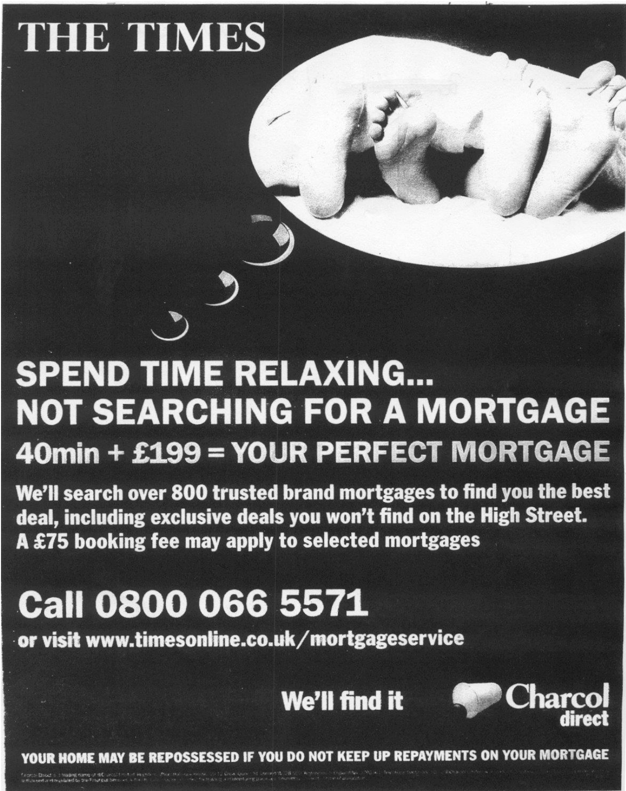
Fig. 2 '40 min + £199 = Your Perfect Mortgage' (Charcol direct, The Times , Nov. 2006)