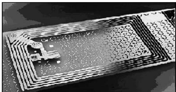
Figure 2. Image of RFID Tag

The reader can have a different designs for library use based on application, for instance: two non-movable antennas with a reading distance of 3 feet between the sensor gates for theft detection, a paper-sheet size antenna on a desk-top reader with an approximately one foot reading distance for discharging and issuing materials and a hand held unit called a wand with a 6 inch reading distance for inventory control or stock verification. Additionally, the readers differ in reading speed and the amount the data that can be read simultaneously as well.