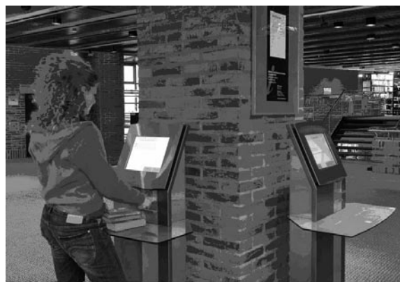
Fig. 5: Self-service unit

to achieve a high percentage of self-service, otherwise the accepted usage is around 25%. In the case of RFID self-issue, faster and easier book checking has resulted in much larger proportions of books being returned without staff intervention, over 40% at Middlesex University.