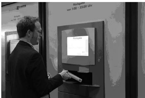
Fig. 3 Returning a book

Another interesting item which the RFID tags facilitate is the book sorter. Because line-of-sight access to the tag is not required, it is possible for a user to put a book on a pad, cancel the loan, read the type of book and sort it to a trolley.