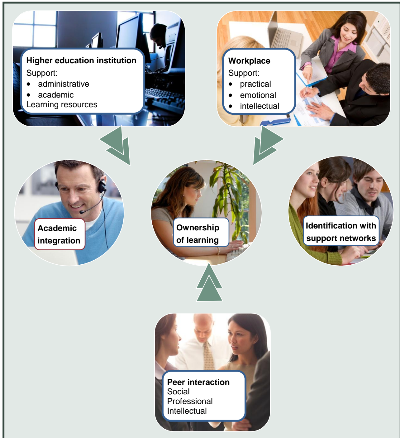
Figure 2 Model of student engagement

Therefore, when practical enquiries arose, students often directed these to their advisers or asked them to suggest other people who could help them. Others located administrative help by making a general enquiry through the university switchboard. Some students, however, faced more sustained administrative problems relating to the payment of their fees. In these cases they developed closer relations with individuals in the administration with whom they liaised to sort out the problem.