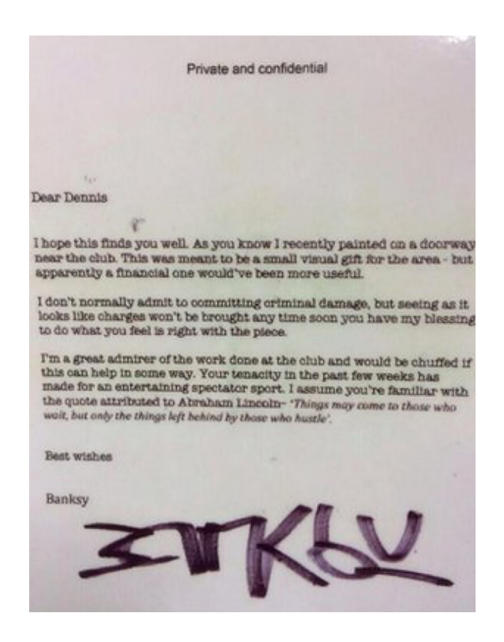
Figure 4. Letter of authentication confirming the intended beneficiary of Mobile Lovers (2014) Banksy 6^{th} May, 2014.

http://metro.co.uk/2014/05/08/banksy-mobile-lovers-letter-bristols-broad-plain-boys-club-to-keep-painting-4721191/ (accessed 15 May 2016)