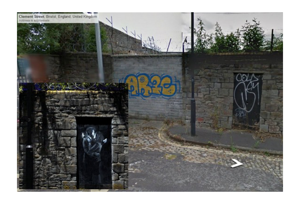
Figure 1. Banksy, Mobile Lovers 2014. Main image Google Streetview, inset photograph of Mobile Lovers by Banksy (www.banksy.com). Exterior of Broad Plains Youth Club, Clement Street, Bristol, England. http://www.telegraph.co.uk/culture/banksy/.jpg (accessed 15 May 2016)