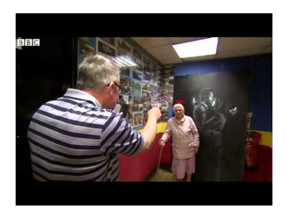
Figure 2. Banksy, Mobile Lovers 2014. Interior of Broad Plains Youth Club, Clement Street, Bristol, England. https://www.youtube.com/watch?v=846D5UipfIs (accessed 15 May 2016)