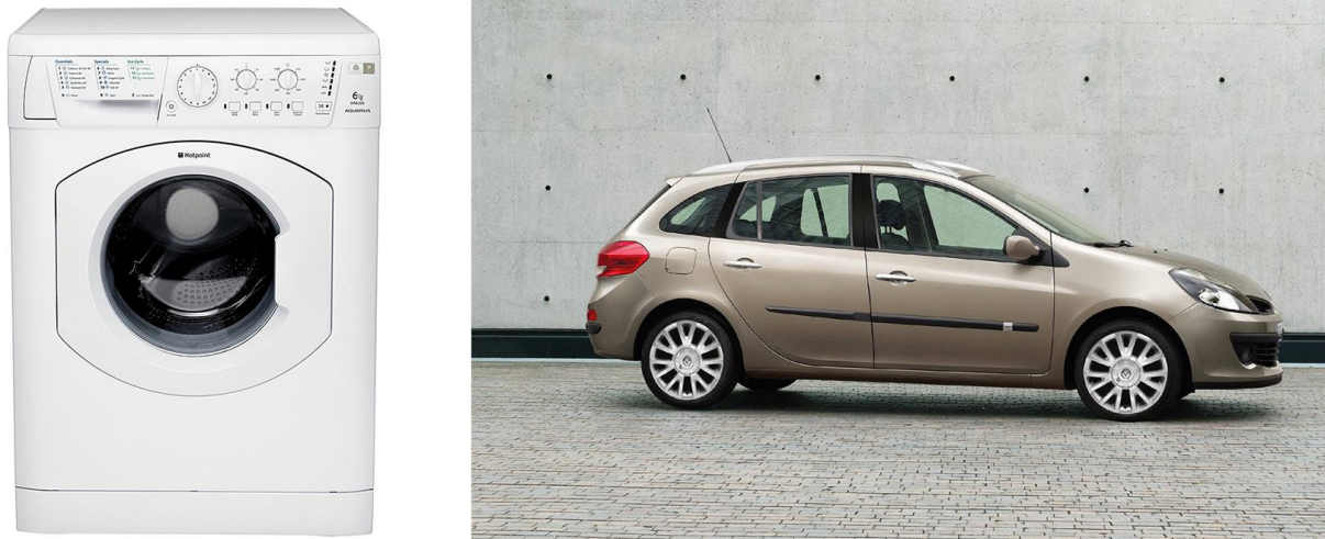
Figure 1. Domestic Appliance [left] (Hotpoint WML520P, n.d.); Car [right] (netcarshow.com, 2008).

Female, age 39. Married with two children aged 3 and 8 months. Lives in Hertfordshire. The two product choices are low interest items in her life.