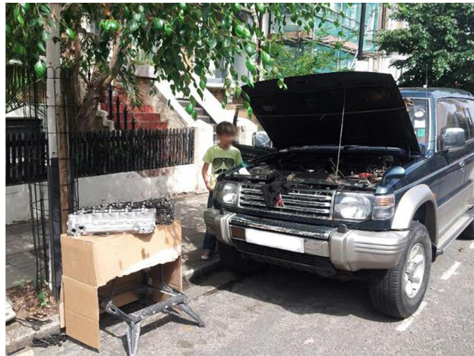
Figure 4. Car . No image of the washing machine was available.

Male, age 52. Married with two children aged 12 and 15. Lives in London. Is an inveterate fixer of things.