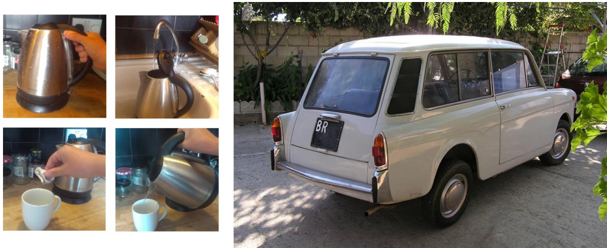
Figure 3. Domestic Appliance [left] (author's own image); Car [right] (autobelle.it, 2016)