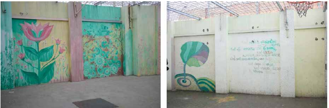
Fig. 4. Earlier inspirational murals in an isolation unit