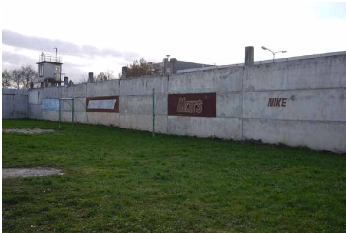
Fig. 2. Post Soviet-era mural showing newly available brands