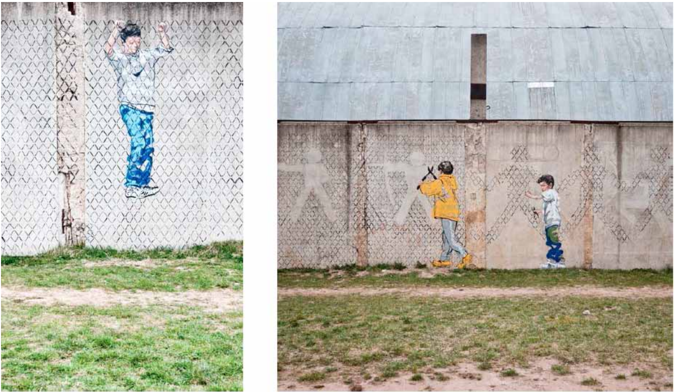
Fig. 9. The reworked mural in Recreation Area 2