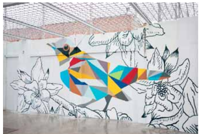
Fig. 5. The isolation unit during and post intervention