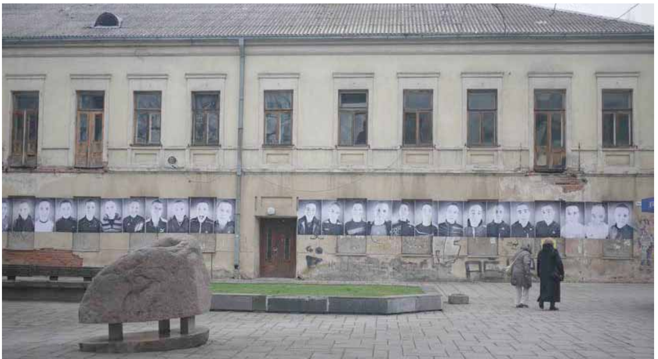
Fig. 10. The Recreation Area 1 wall mirrored on Kaunas Former Police Headquarters