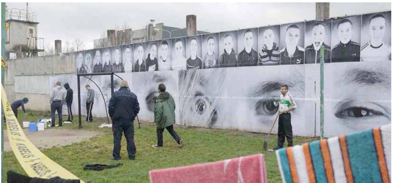
Fig. 7. Co-producing the wall in Recreation Area 1

The order of the groupings in which the photographs appear reflects the young men's own acknowledgement of both friendships and hierarchical social networks within the correctional facility (see Figure 7, below).