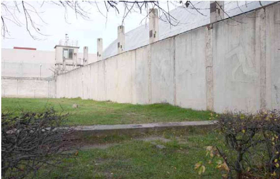
Fig. 1. Soviet-era mural featuring sporting pictograms