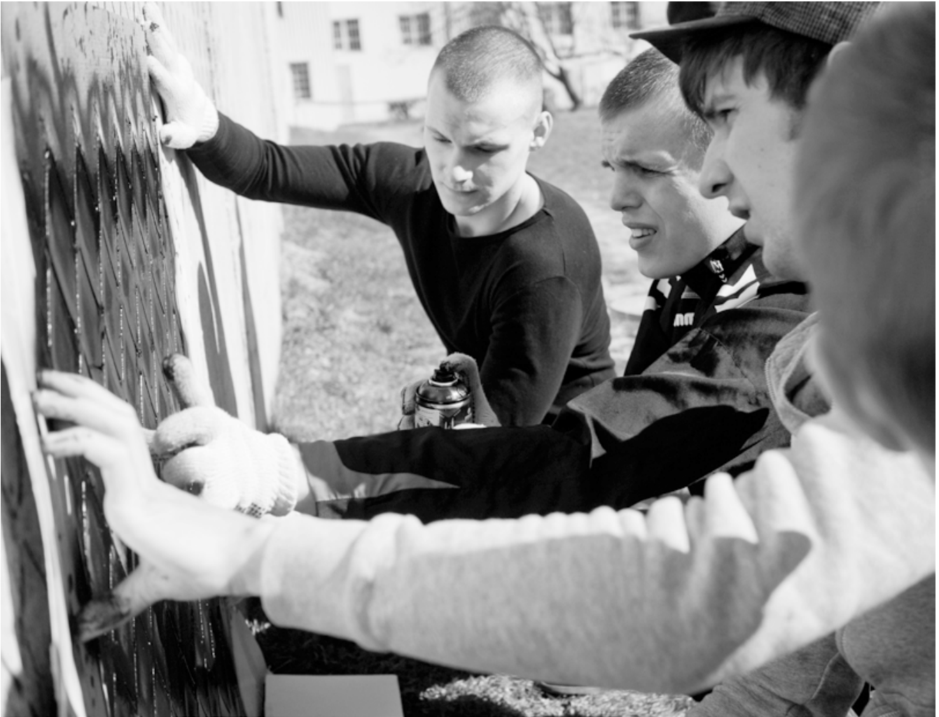
Fig. 8. Young offenders learning stenciling techniques with Zacharevic

The second recreational area was co-produced with the artist Ernest Zacharevic. The young offenders engaged with the production of this work assisted the artist and learned stenciling techniques in the process.