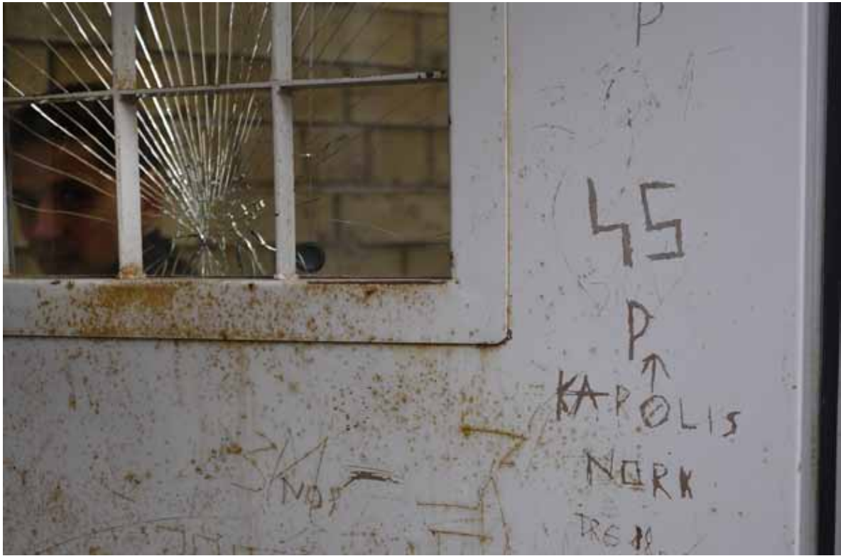
Fig. 3. Internal door of isolation unit