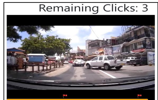
Fig. II – Hazard Perception Test