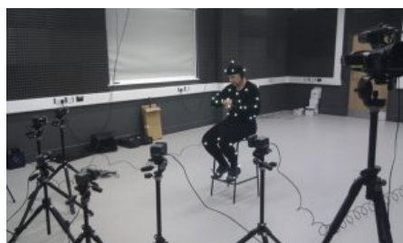
Figure 1: Motion capture setup

To combat this, a small lead in or warm up chat was included as part of the footage. The technician and student retreated behind a screen where I could not see them and soon forgot about them. My colleague had an easy-going and friendly manner, such that after the initial and inevitable feelings of self-consciousness I felt I was able to relax and absorb myself in recounting my experiences. I was aware at the time of filming that I would be very likely to be expressing my own learned display rules, but as this was to be a self-reflective and auto-ethnographic exercise in many ways, recorded examples of inhibited emotion would be as interesting as an uninhibited, but uncharacteristic, display.