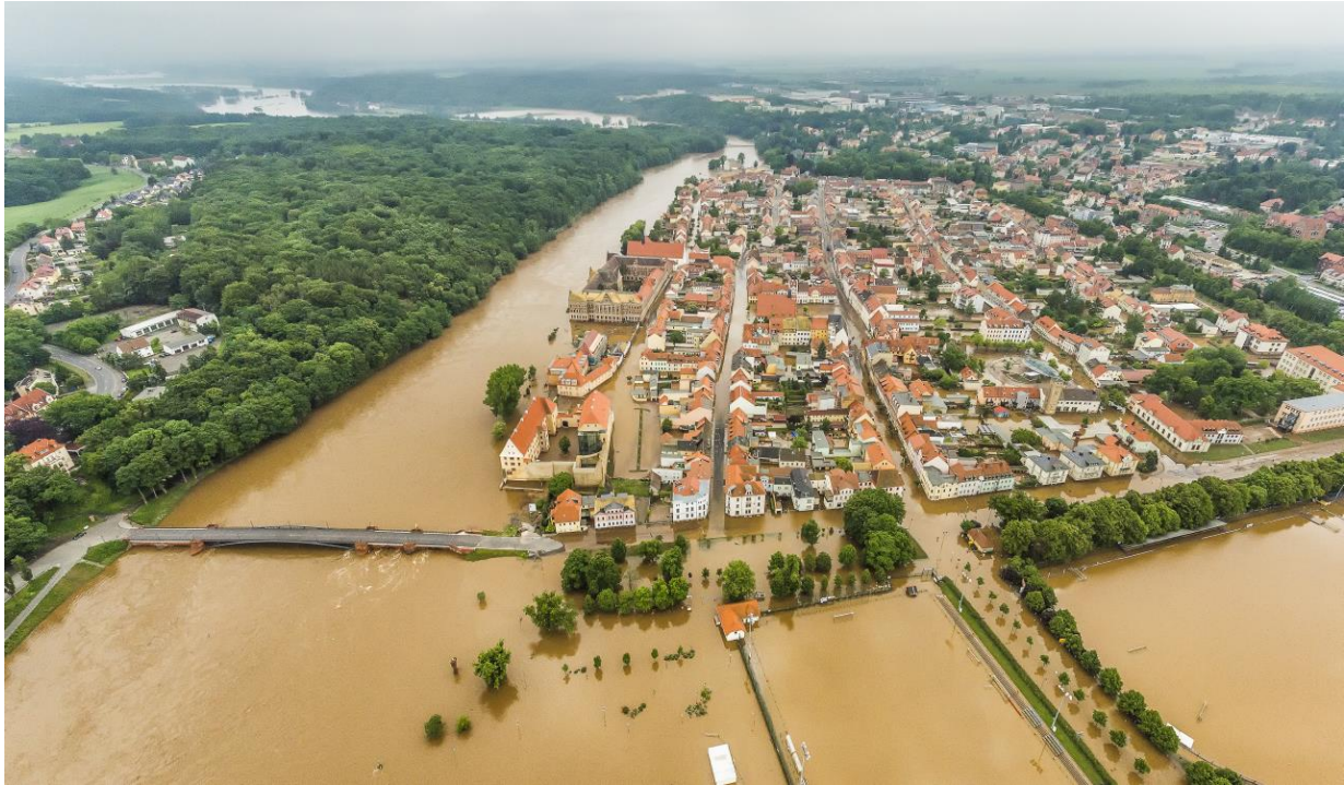
Large-scale flood in the Elbe basin, Germany, in June 2013. The City of Grimma.

Evolutionary leap in flood risk assessment methodologies is needed to reliably quantify real large-scale risk used to inform national and river basin policies worldwide.