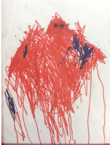
Fig. 5. Scribble inspired by Big Hero6. Felt-tip pen. Age 6.

Scribble might be seen as the child’s tracing out of the hegemony of the signifier.