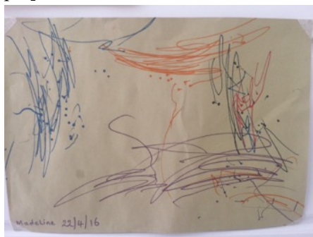
Fig.4. Scribble produced at home. Felt-tip pen, Age 2.