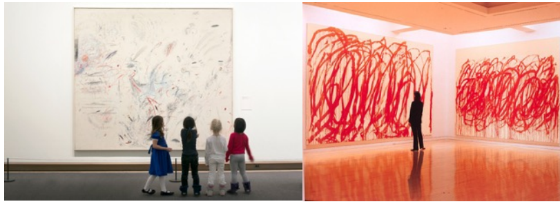
Fig.3. spectators in front of Cy Twombly's Untitled and Bacchus Musuem Of Metropolitan Art & Tate Gallery

experimenting by drawing with his left hand, by balancing on a friend's shoulders or in the dark in order to arrive at what he called 'primordial freshness'. (Pinkus-Witton, 1974).