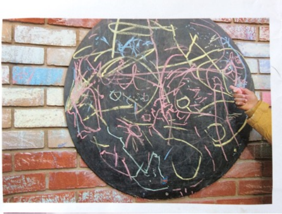
Fig.2 Wall action scribble in chalk. Age 5. Feb. 2018

On one such corpus observation of a Reception (age 5) child, I watched a boy scribble for over ten minutes on a wall board and the surrounding bricks outside, accompanied throughout by a running humming, singing rap commentary ('ooh, ooh, red and blue, bhaji, bhaji, in the dot-dot-dot-dot, wah, wah, wah, wah, a-go, a-go, les' go, rah, rah, rah, I'm in the lava, in the lava, I've got a sabre and a star and a star...') with frenetic jiggling or dance steps. This all whilst also holding a large plastic steering wheel, a glove and an orange in one hand, and his chalk in the other.