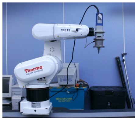
Figure 5 – Automatic tool changer with motor and tool holder as the new end-effector for the F3 robot

Finally the design was tested with the motor on without cutting loads at its lowest RPM – 10,000.