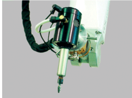
Figure 3 - Application of robotic arm in deburring of metal and plastic moulded pieces [7]

(Fig.3). This option applied to this specific project of routing would mean a different motor for each routing tool on the tool changer and that would be a costly option.