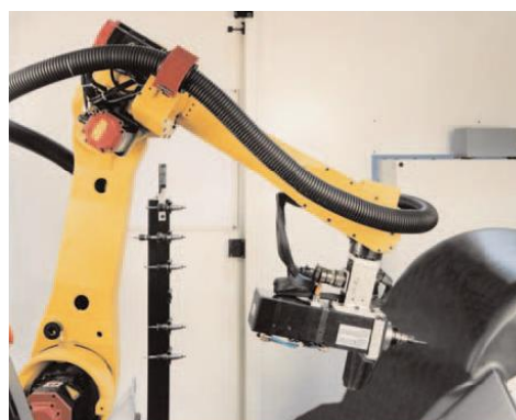
Figure 2 – Robot Trim RT-400 with V-taper automatic tool changer [6]

Industry examples used in routing found during this research use large payload robots that borrow motors, spindle and automatic tool changers for the CNC routing industry (Fig.2). Automatic tool holders for CNC routing industry use a drawbar mechanism that clamps tool holders to a spindle. For this type of end effectors the lightest tool changer found weighed 3.5 kg and this is excluding any motor.