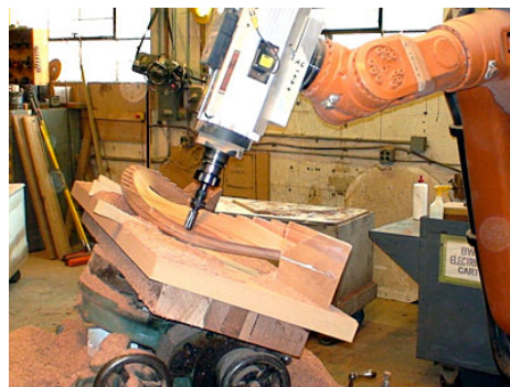
Figure 1 - Robot at work in Louis Mackall's Breakfast Woodworks cabinet making company [3]

Examples of articulated robots used in routing of wood materials are increasingly found in industry [2] (Fig.1).