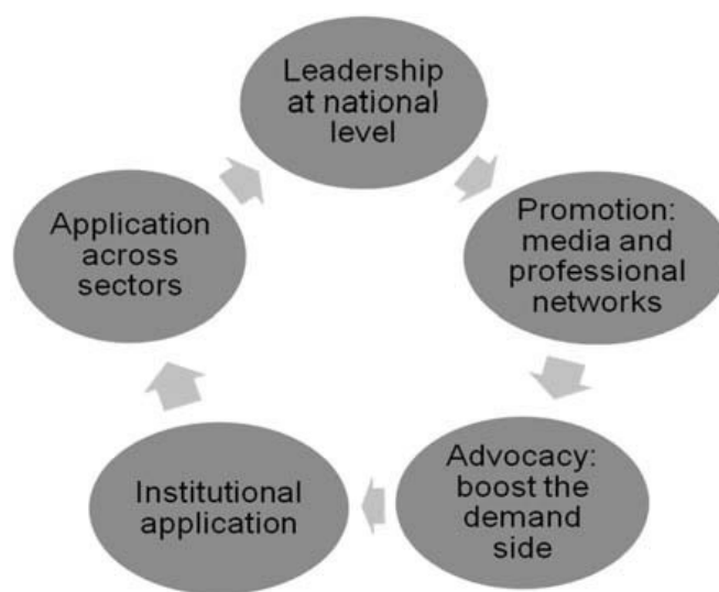
Figure 1: Human rights implementation cycle

Within this scheme, national leadership is required to promote the principles of human rights case law – both from central government policy departments and national human rights institutions, as well as others with national influence such as regulators, inspectorates and ombudsmen. This is especially valuable to counteract any tendency among public authorities to respond to judgments in a reactive or piecemeal way rather than considering whether human rights principles demand a more fundamental shift in thinking. Promotion of human rights judgments via professional networks and traditional and social media is proposed as an effective way to reach practitioners, given the patchy institutional application of case law. The public profile of a judgment may also galvanise authorities concerned about reputational risk.