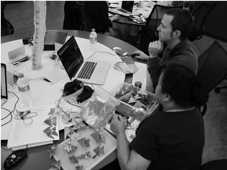
Figure 13.3 Filmmaker and Kim editing her digital story

Participation in the digital storytelling project has meant a great deal to Kim personally (Figure 13.3): 'I learnt that it's not only me, everyone [has] got their