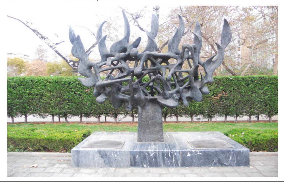
Figure 2. Memorials.