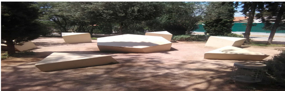
The Holocaust Memorial in Thessaloniki, Greece