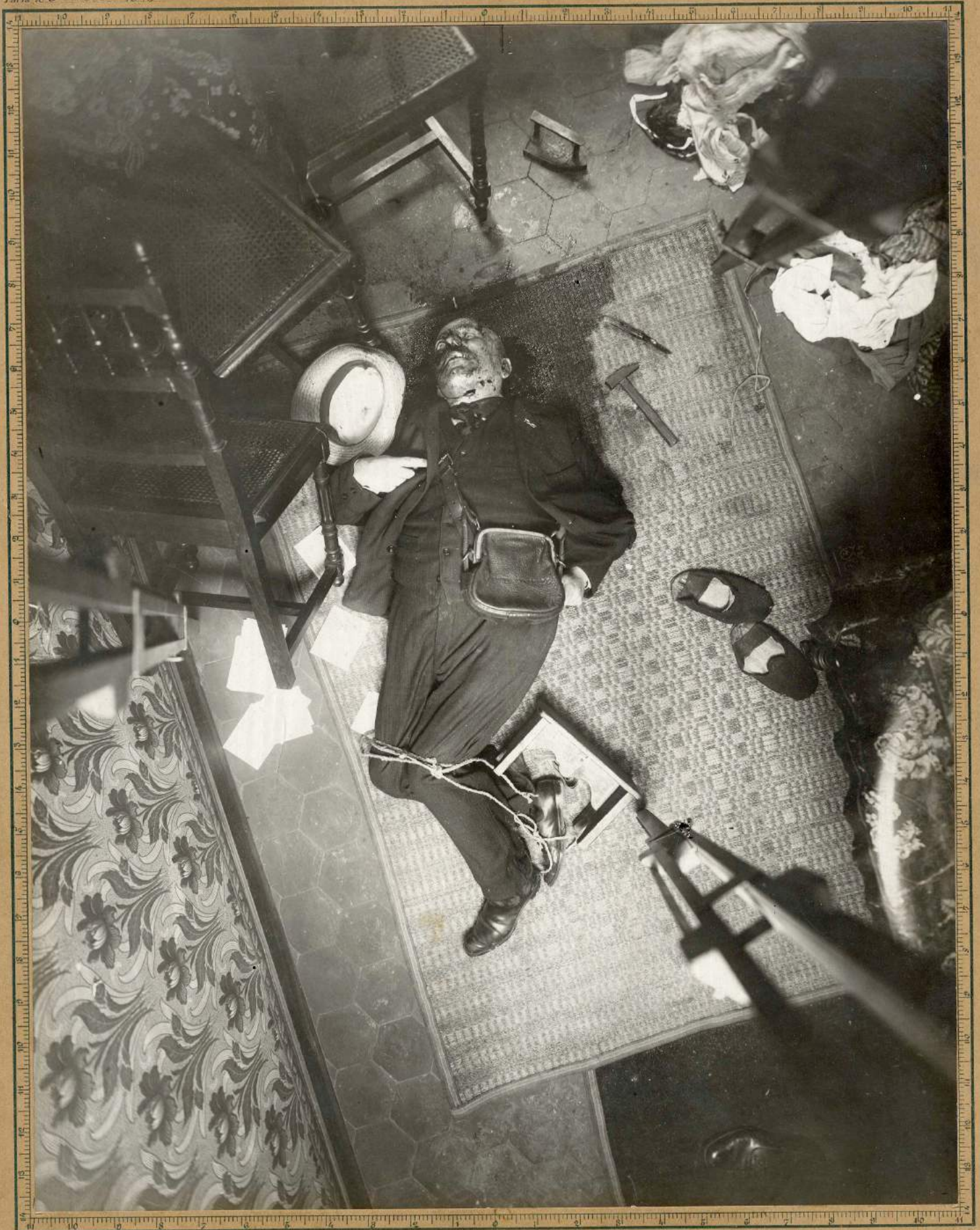
Sur l'encadrement: Graduation centimétrique divergente en grandeur réelle.