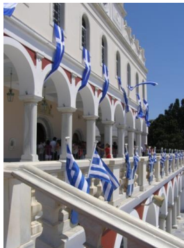
Figure 3. Church of the Annunciation, Tinos, Image copyright of first author

Mary of Tinos. Similar to previous studies (Kim and Chen, 2016; Siripis et al. , 2013), authoritative powers influence visitation patterns to Tinos, using visual media that authenticate places through processes of meaning making. On the 15 th of August the image of festive Tinos circulates all over Greece with TV news focusing on the holy icon, the leading politicians, and the crowds of people participating in the celebration. These festive images are accompanied by scenes including Greek flags fluttering all over the island of Tinos (Figure 3) along with the presence of navy generals and military ships providing symbolic gunfire. Such visual scenes construct imaginings and longings for the place building upon collective understanding, identity and belonging. As Vaso (F, 62) explained: “ it is a priority and commitment for all Greeks ”. For most Greeks, this is clearly what Bhardwaj (1973) termed a ‘national pilgrimage’. “ Here is our Virgin Mary, she is our Virgin Mary... for those of us who cannot travel outside Greece, the Virgin Mary is Tinos ” [emphasis as original] (Anna; F, 41). Similar to the meaning the Wailing Wall has for the Jews, Greeks are attached to the site as it is part of being Greek, of performing everyday Greekness and being Christian Orthodox. As Nicky (F, 80) commented: “ every Christian comes round to Tinos. Whoever you may ask, he will say that at least once in his lifetime he has been there. ”