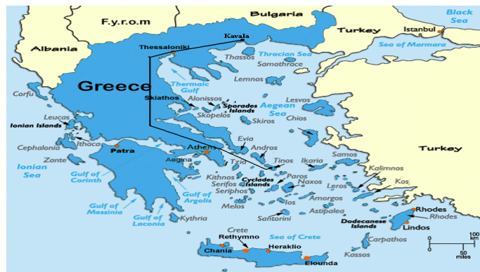
Figure 1. Trips' route

To further ensure trustworthiness of data, issues of reactivity (Bernard, 2006) needed to be eliminated. Specifically, to reduce violation of scenes due to researcher presence, notes were made in absence of the participants. Scratch notes were made during the day whenever the researcher was alone, thereby recording mental notes of interesting occurrences (Lofland and Lofland, 1995). These were then meticulously analysed and emergent themes highlighted at the end of each day in the privacy of the researcher's hotel room.