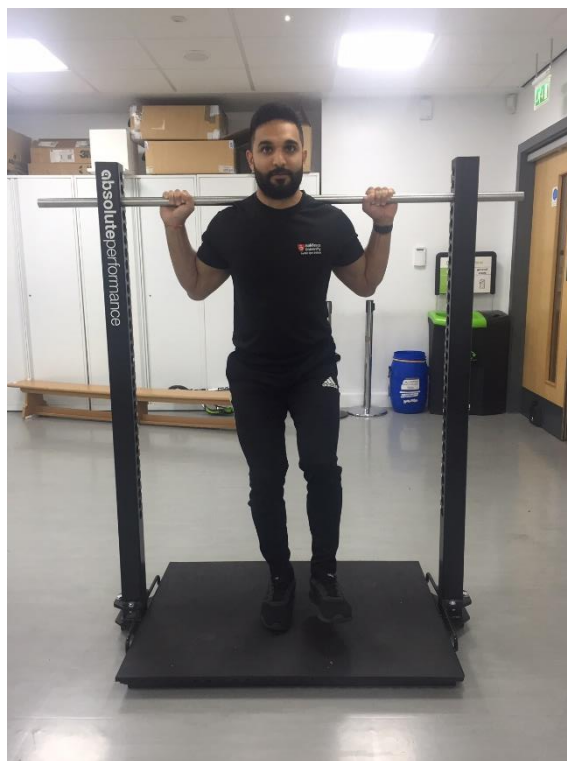
Figures 1a and 1b: Example positioning during the unilateral isometric squat test.