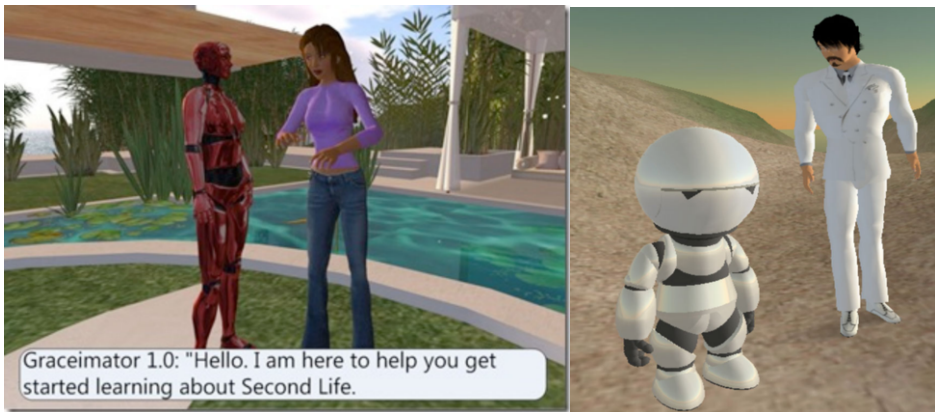
Figure 1. Pikkubots interacting with student avatars

environment to change the building style they are in to study different elements of architecture related to a certain era e.g. in an Egyptian, Chinese, Indian, Roman, Classic style temple or building. The building prototypes would be created then loaded inside a Holodeck (a commercial example of which is “Horizon Holodeck”). The student or tutor can choose whatever environment he wishes for to open up around him from a menu that appears for him inside Second Life. A Pikkubot would then appear, as shown in Figure 1, dressed appropriate to the era chosen and provide information about the architecture and design, asking questions interactively from the student. Other applications of this system can be e.g. to rez a courthouse to conduct forensic studies investigation and role-play.