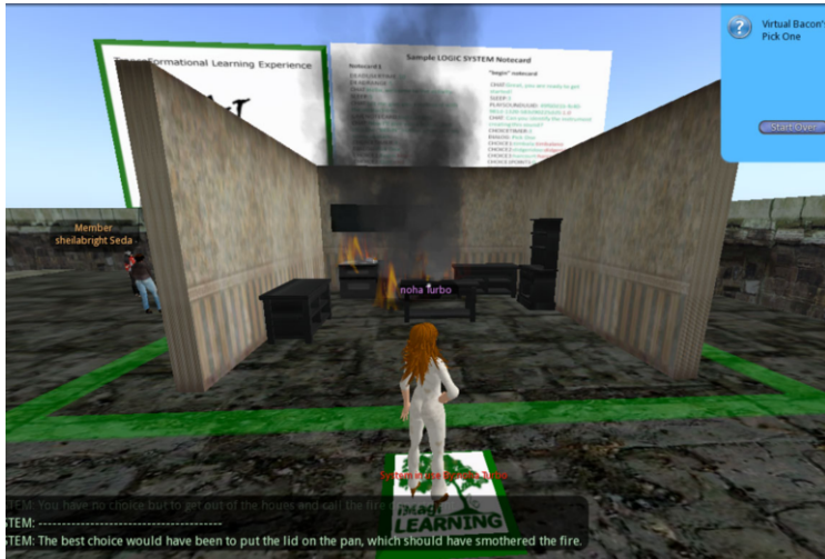
Figure 6. Holodeck rezzing an interactive kitchen environment

“Virtual Sensor Simulation” is a final project example, which uses reflexive architecture techniques in SL, which use sensors to identify approach of avatars. This can be used to simulate robotic movement, car crash etc. to help with real-life design of these devices.