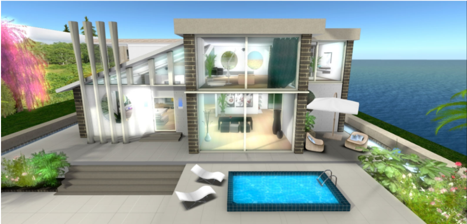
Figure 4. Holodeck rezzing complete buildings for demonstration

etc., and automatically samples of model house appear before him to choose from (from a holodeck) as can be seen in Figure 4. This has potential of being an online service for a real-life business.