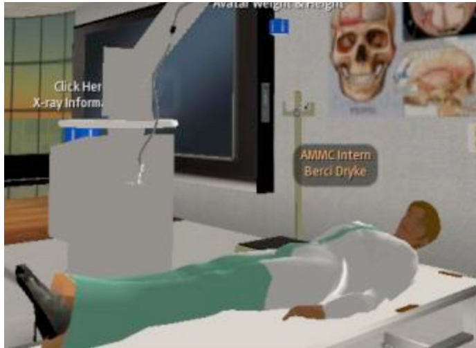
Figure 2. Pikkubot posing as virtual patient