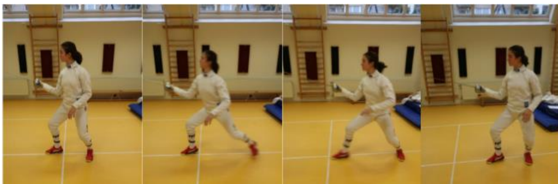
Figure 3a-d (left to right). A ball of foot facilitated retreat. From the on-guard position where the floor contact is mainly facilitated by the ball of the foot (Figure 3a), the fencer pushes-off with the ball of the front foot while the back foot moves back a controlled but longer distance compared