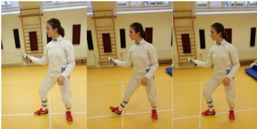
Figure 2a-c (left to right): Classical retreat. From the on-guard position with full floor contact with both feet (Figure 2a), the fencer pushes-off with the heel of the front foot while the back foot moves back a limited distance to land with full floor contact (Figure 2b). Finally, the front foot is moved back to reach the on-guard position once more. The recommended distance varies from one-foot length to not more than 15 cm. The classical advance is simply the reverse.

Similarly, fencers traveling at speed up and down the piste can better undertake this feat by limiting heel contact, maximizing ball of foot contacts, and thus Achilles tendon stretch. This is why fencers should bounce. An alternative of performing the retreat is shown in Figure 3, where the fencer pushes-off with the ball of the foot instead of the heel. This gives the fencer the possibility to preload the Achilles tendon with elastic energy (more so if the movement is initiated with a single bounce). Again distance is increased, which is especially notable with multiple consecutive retreats.