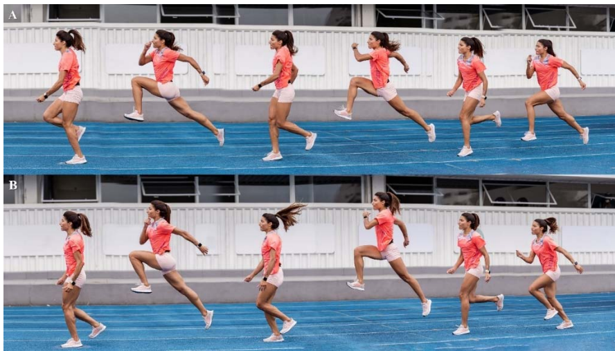
Figure 5. “Alternate sprint bounding” (Panel A) and “alternate traditional bounding” sequencing (Panel B).