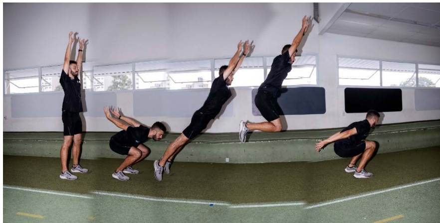
Figure 6. Standing long jump sequencing.