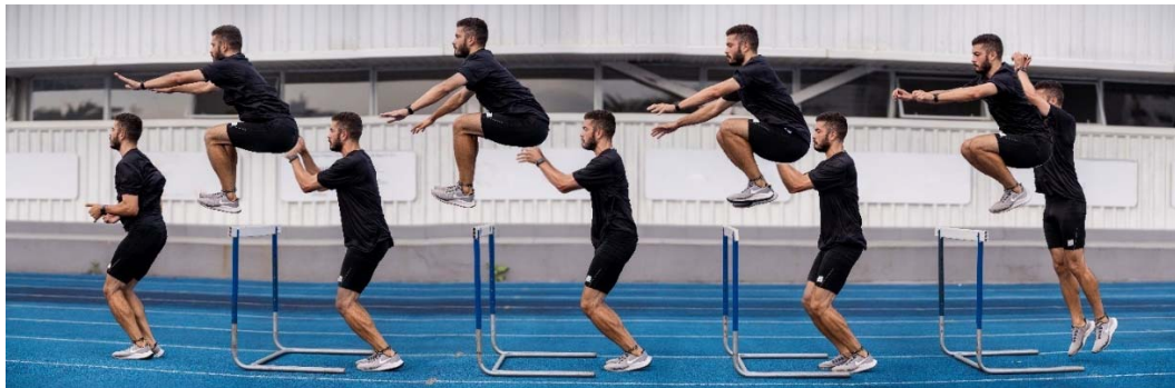
Figure 1. Hurdle jumps sequencing.