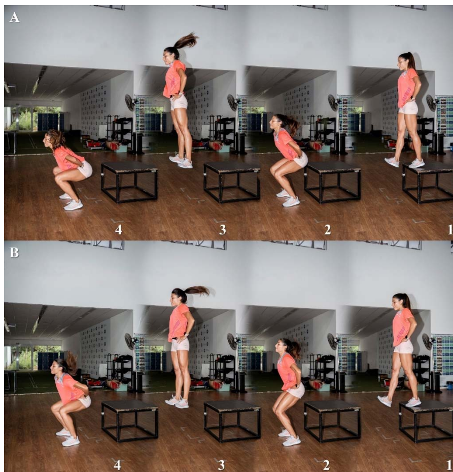
Figure 2. Drop jumps execution, under two distinct verbal instructions: “jumping for maximum height” (Panel A) and “jumping for maximum height with minimum contact time” (Panel B), at the initial (1), contact (2), flight (3), and landing (4) phases.