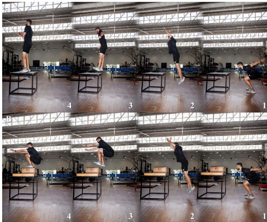
Figure 3. Box jumps execution, under two different conditions: “using the optimal box height” (Panel A) and “using an exaggerated box height” (Panel B), at the initial (1), flight (2), final approaching (3), and landing (4) phases.