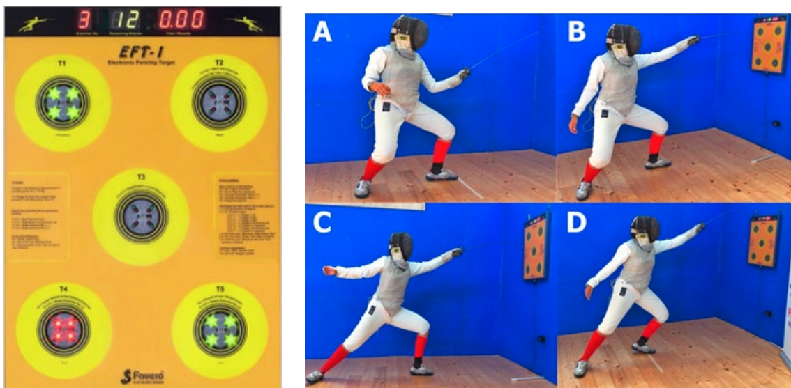
Figure 1 (left) and Figure 2 (right)

Figure 3. ROC curve analysis relative to graphics of the three tests. C.O.=Cut-Off; Se.=Sensitivity; Sp.=Specificity; NF=Novice fencers; EF=Elite fencers.