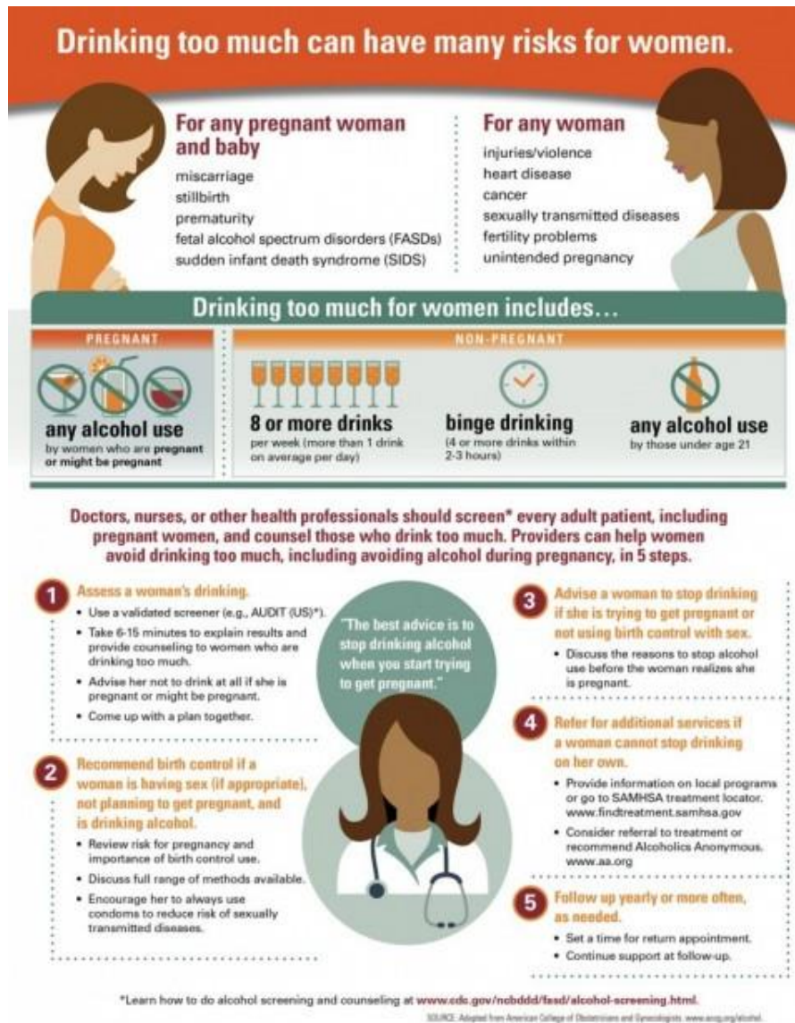
Figure 2 Centers for Disease Control and Prevention guidance on alcohol-exposure during pregnancy, as first published. 1