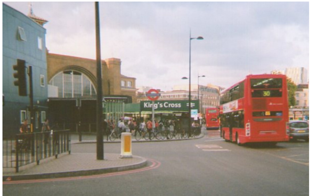
This is King's Cross. This is the first station I used when I came to this country. We were going to Bank, to get my travel documents from the refugee centre. I was scared because I never used the train before but I enjoyed myself. At the refugee centre I got my documents.