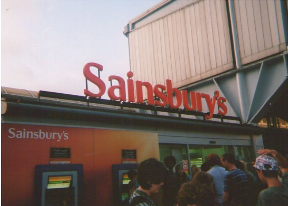
This is Sainsbury's in Camden. This is the first one I ever went to into this country.