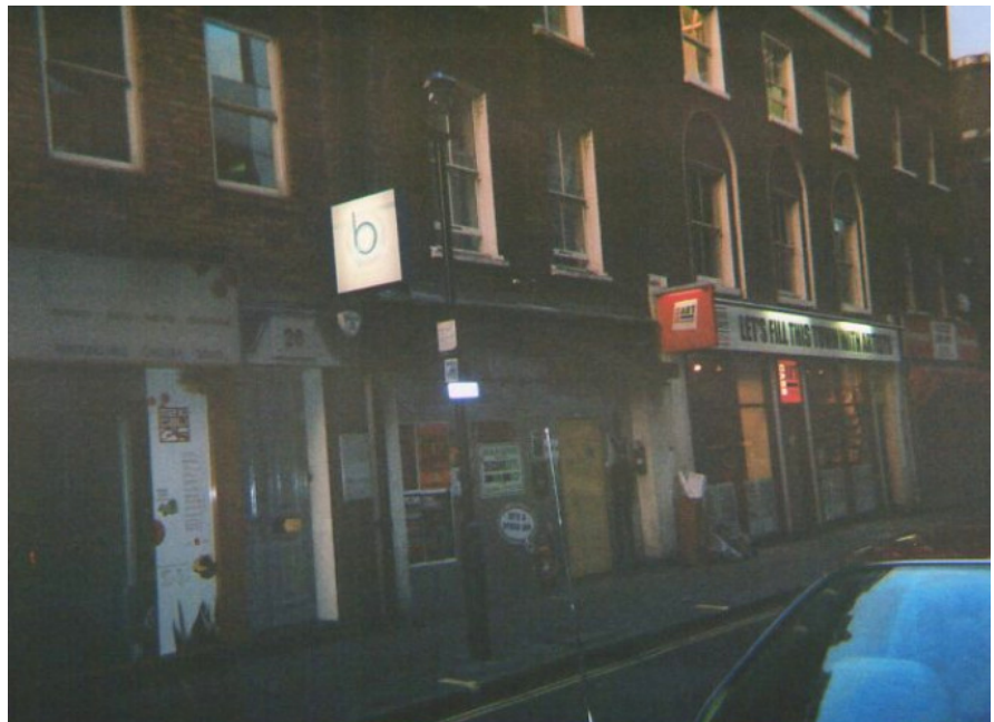
This is Bernick Street hostel. The first hostel I stayed. I spent 28 days. This was very dangerous. There were people fighting, all the time, they had knives. You could not sleep at all. It wasn't good at all.