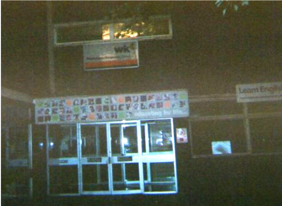
This is Westminster Kingsbury College. This is the first college I went to learn English, when I came into this country. I could not speak English. This is where I came that summer.