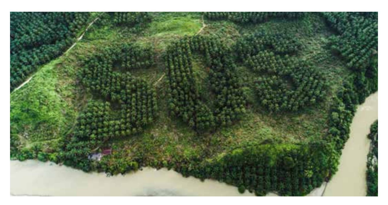
Figure 5. 'Save Our Souls.' Splash and Burn Artist-Led Initiative. Curated by Ernest Zacharevic, Produced by Charlotte Pyatt, Sumatra 2018. Photographs ©Ernest Zacharevic & Charlotte Pyatt.