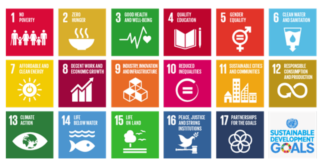
Figure 1. The Sustainable Development Goals.

and identity to connect divided communities; and giving voice and agency to marginalised communities, especially when conventional forms of protest or public expression are impossible within local cultural contexts.