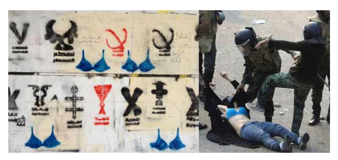
Figure 3. Bahia Shehab. Thousand No Wall. Cairo 2012.

sition, challenging the status quo and resisting oppression peacefully [and may provide] a voice... when all other avenues of political expression [are] closed." Street art's grounding in forms of creative activism, and its accessibility to everyday citizens (both as producers and consumers) arguably make this art form allied to the sustainable development goals.